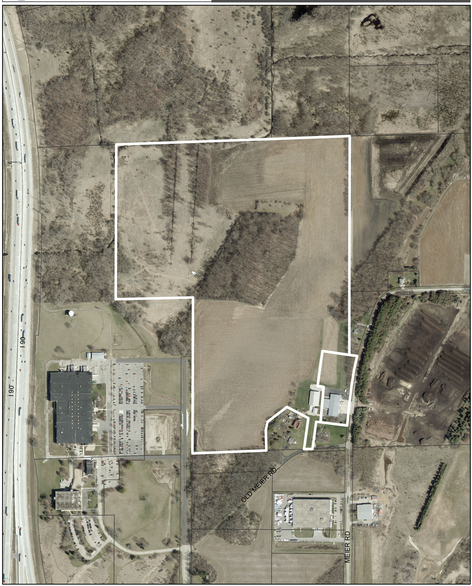
Date of Aerial Photography : Spring 2022