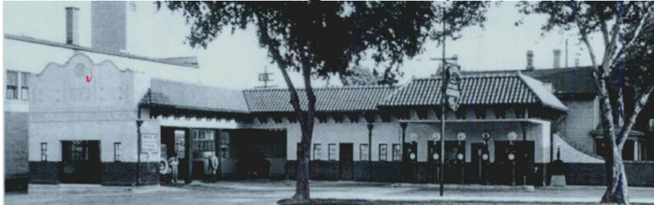
Angus McVicar photo circa 1928