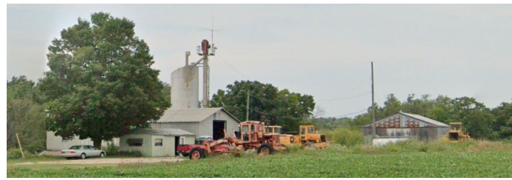
Google Street Views