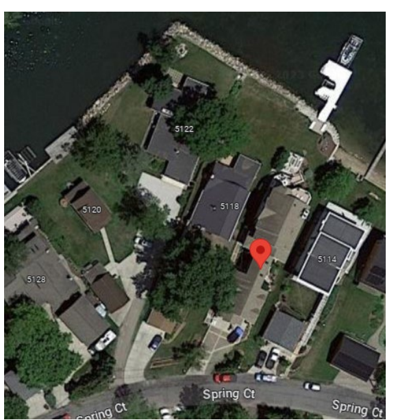
Google Street View Google Earth