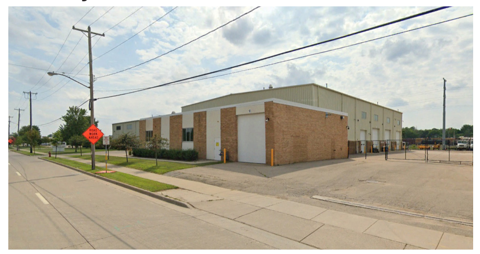
Adjacent Hooper Corporation Building