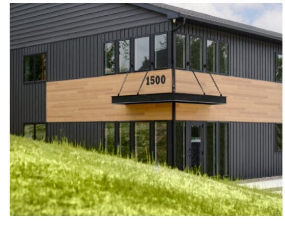
Coal facade on commercial building