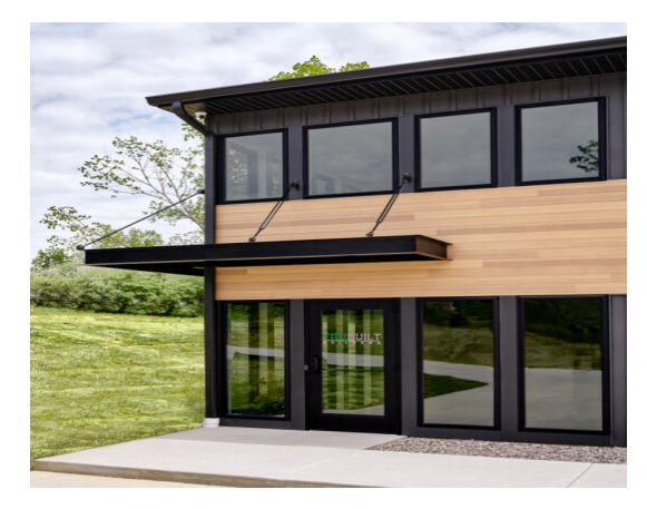
Coal siding used on commercial building