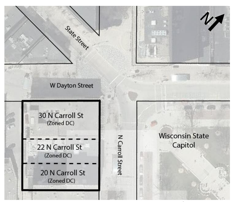
Image 1: The parcels proposed to be combined via Certified Survey Map (CSM) to form the subject parcel

20 N Carroll Street – a three-story commercial building with roughly 3,780 square-feet of retail and 9,730 square-feet of office space. City Assessor's Office records note it was