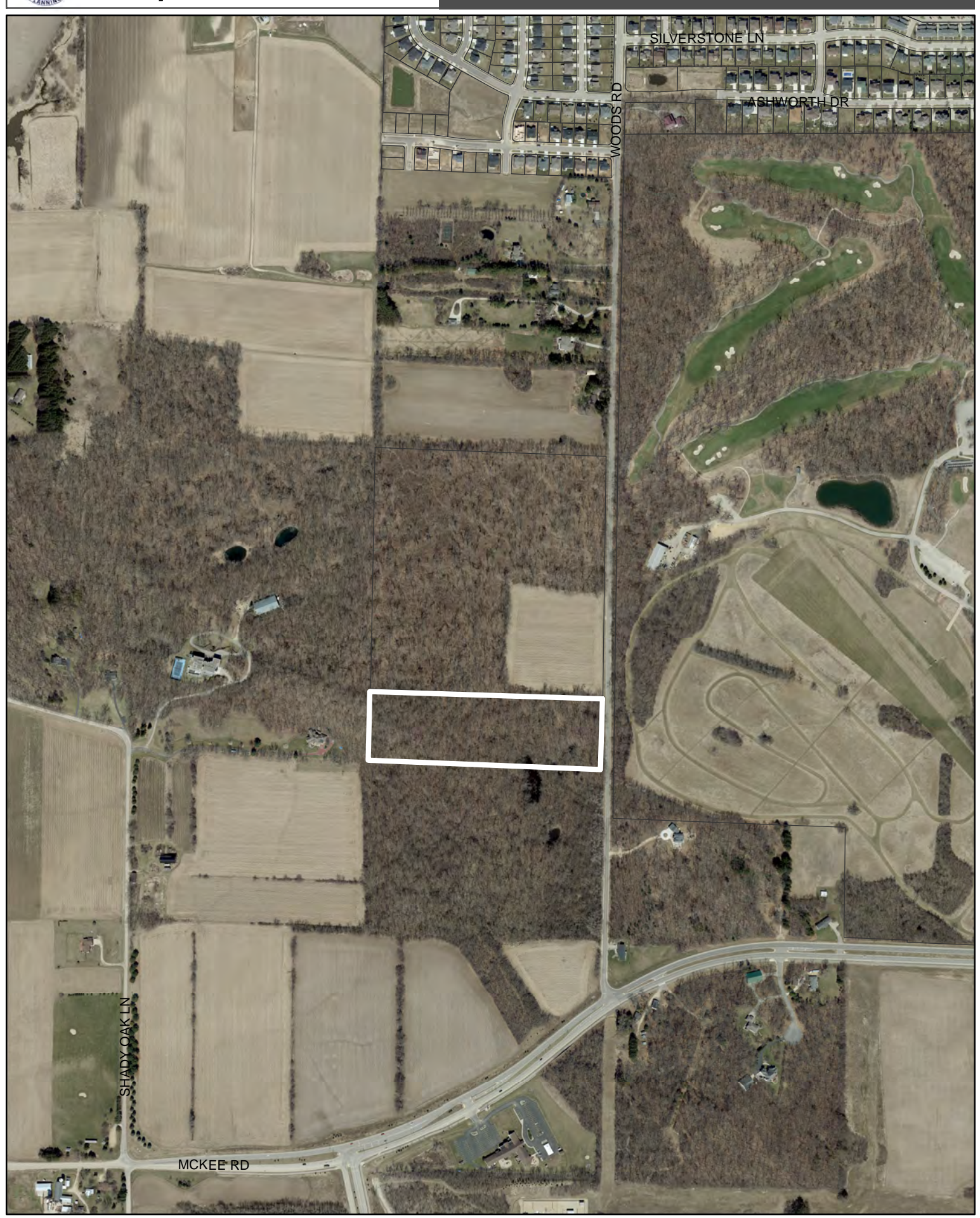
Date of Aerial Photography : Spring 2022