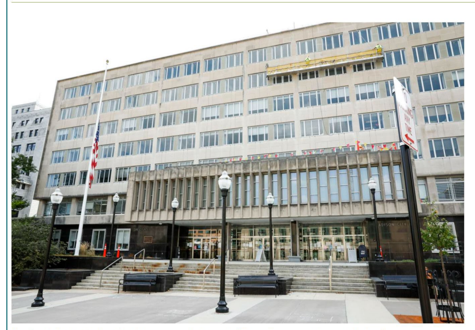
The City Council met on Tuesday and voted to remove protest petitions and retain a simple majority vote for approval of rezonings. RUTHIE HAUGE

Madison Common Council approves Transit-Oriented Development Overlay Zoning Ordinance