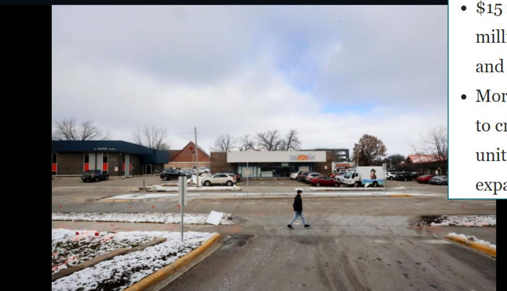
South Badger Road, including the Badger Building, left, Centro Hispano, center, and Metro Transit's South Transfer Point on Madison's South Side. A proposed tax incremental financing (TIF) district could help deliver about $115 million in improvements to the area, including $4 million in development loans for a project at the transfer point.