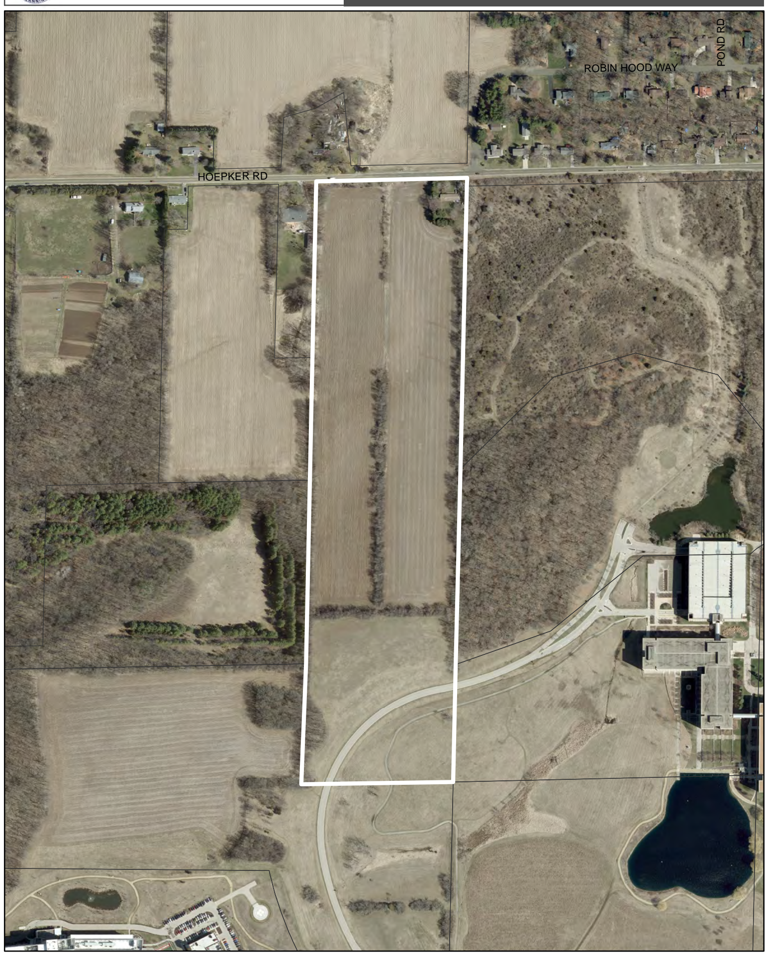
Date of Aerial Photography : Spring 2022