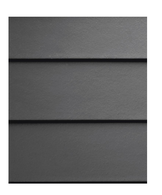
FIBER CEMENT SIDING COLOR: "HARDIE PLANK LAP SIDING "NIGHT GRAY" SMOOTH

DATE REVISIONS 1/27/2023 3/7/2023 REV: 5/3/23