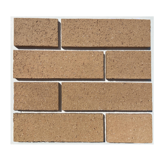
FACE BRICK: "BELDEN BRICK CO." COLOR: MODULAR 461-463 VEL