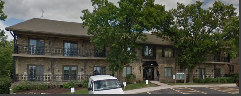
6417 Odana Road Constructed 1979