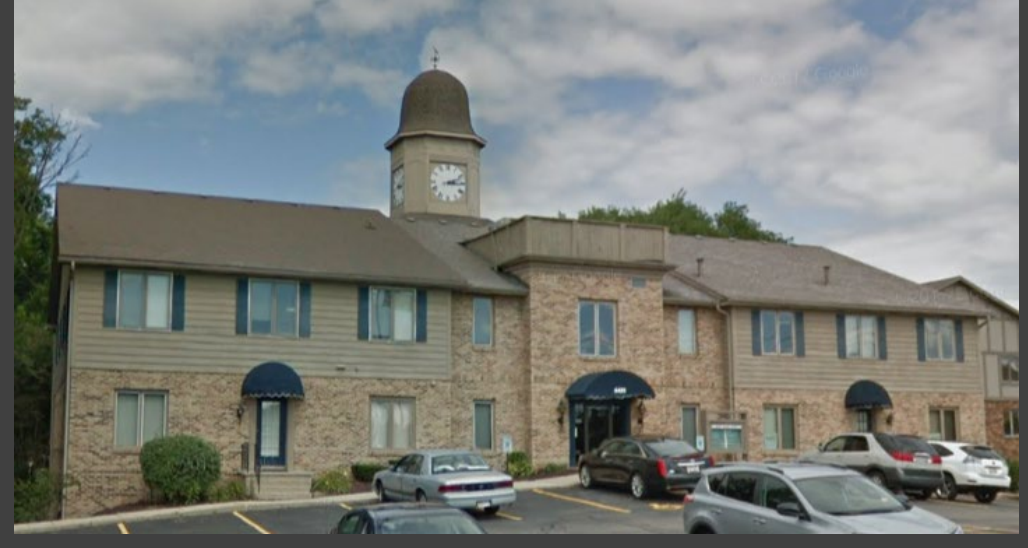
6425 Odana Road Constructed 1978