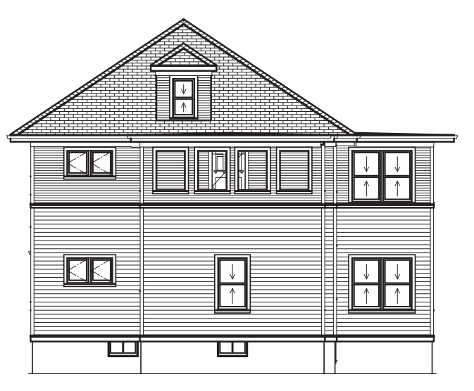
North Elevation, Proposed