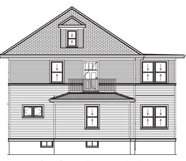
North Elevation, Existing