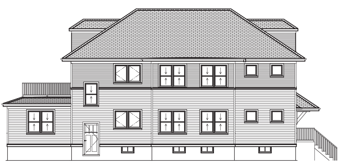
West Elevation, Existing