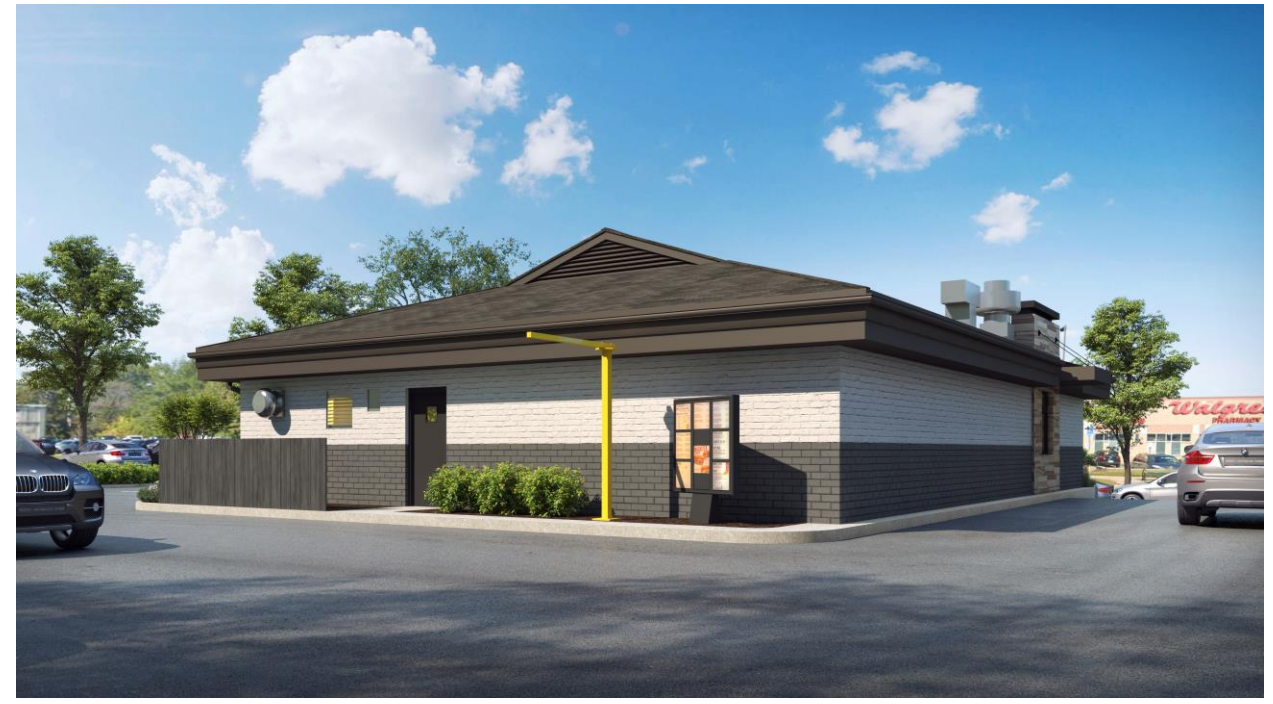
Figure 4 Proposed rendering, view of South & East walls.

Sincerely, Nathan Remitz A.L.A. Architect / Partner