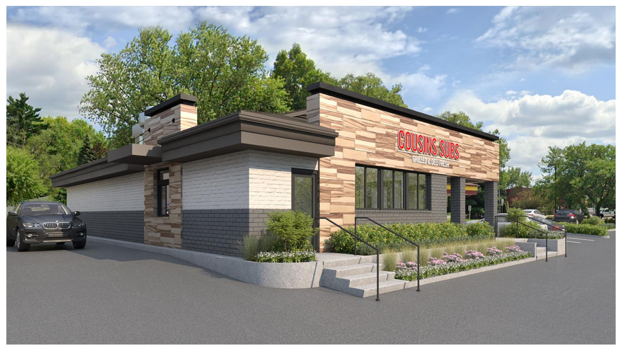
Figure 2: Proposed rendering, view of North & East walls