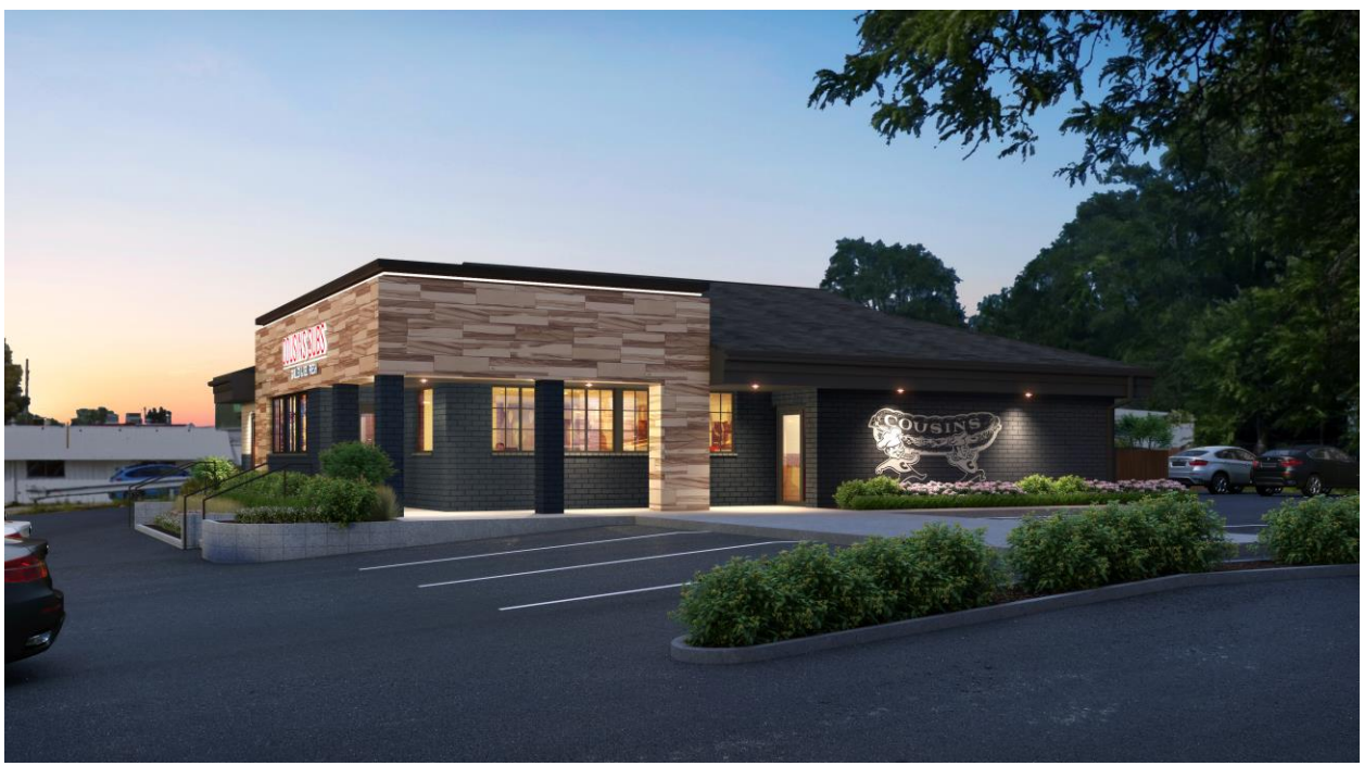
Figure 3: Dusk Scene with conceptual lighting and building façade / site updates, view of North & West walls.