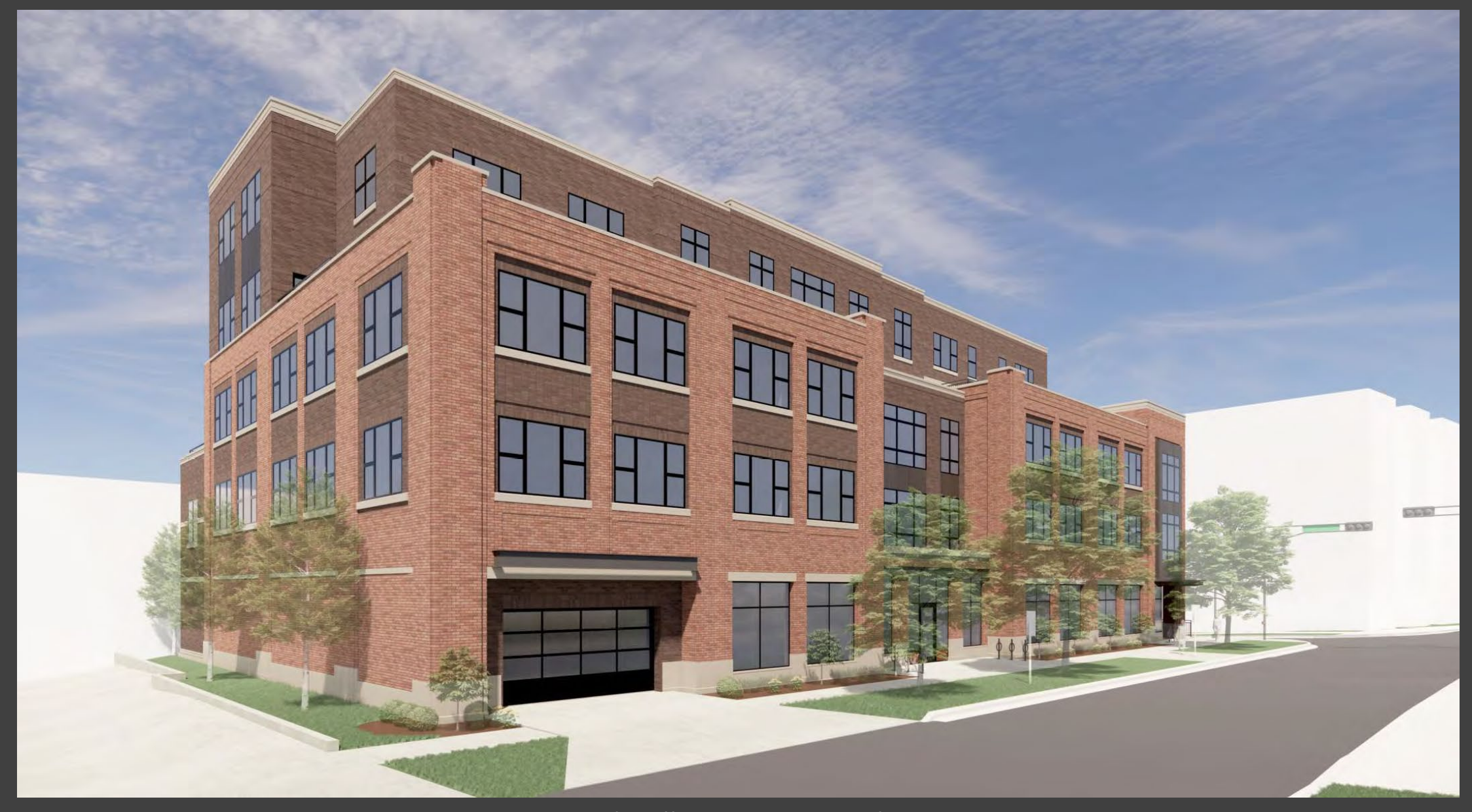
Proposed Williamson Street Elevation