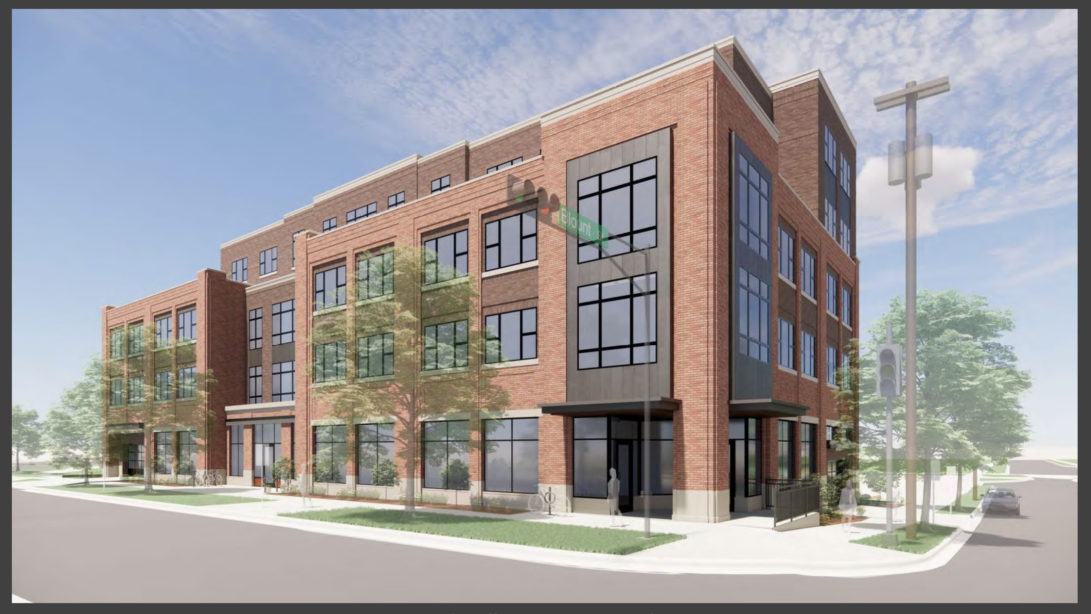
Proposed Williamson Street Elevation