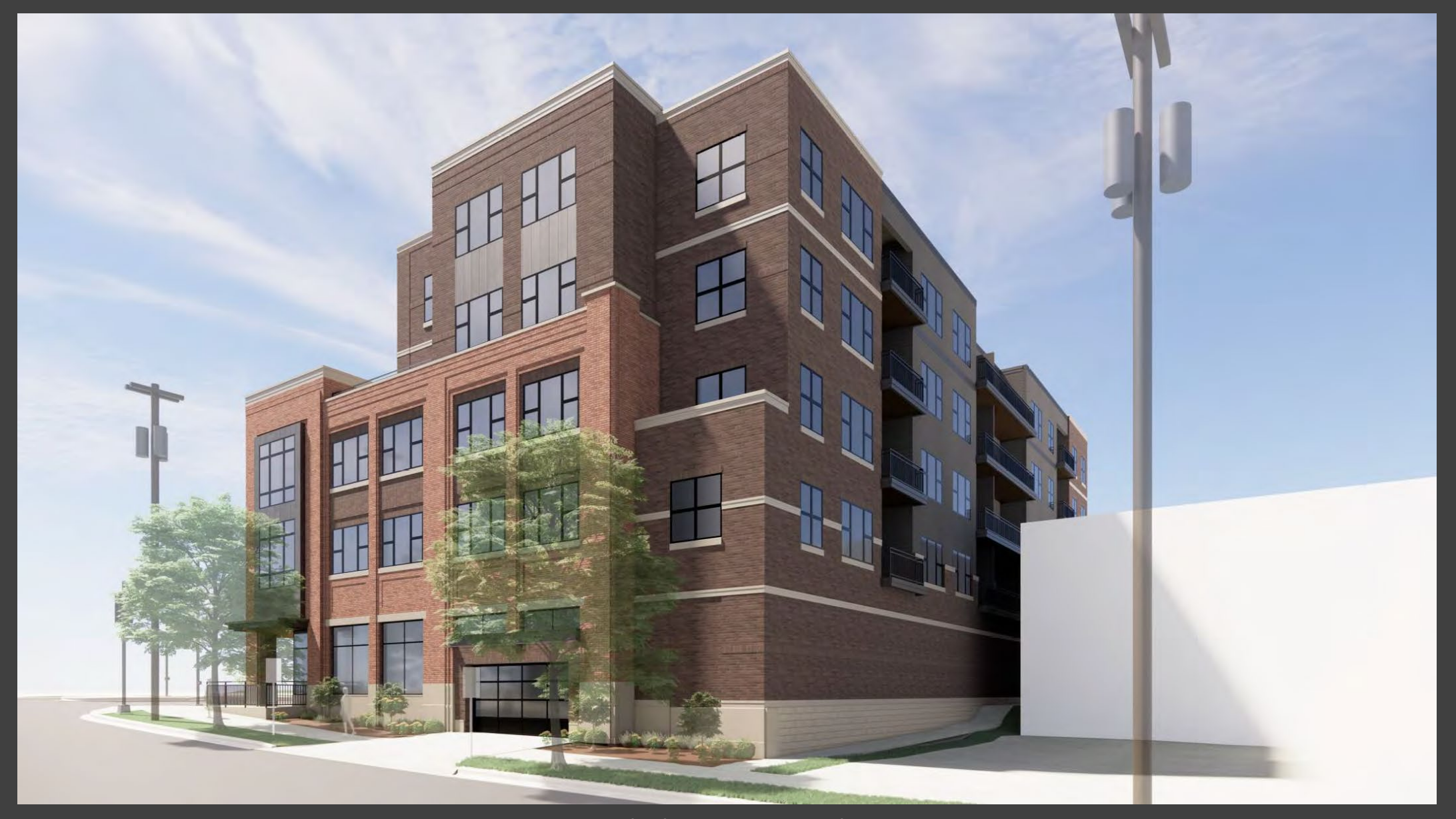
Proposed Blount Street Elevation