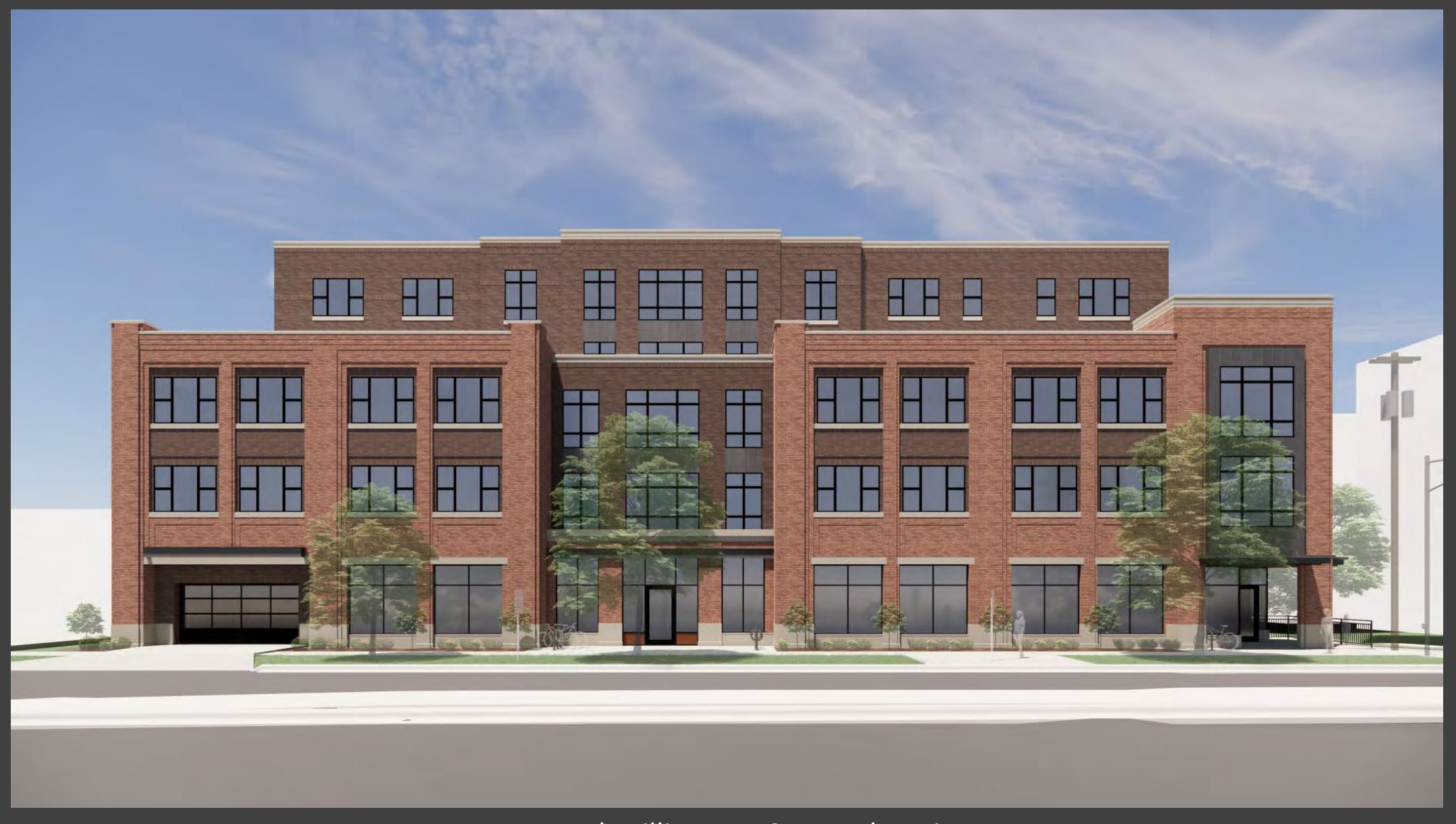
Proposed Williamson Street Elevation