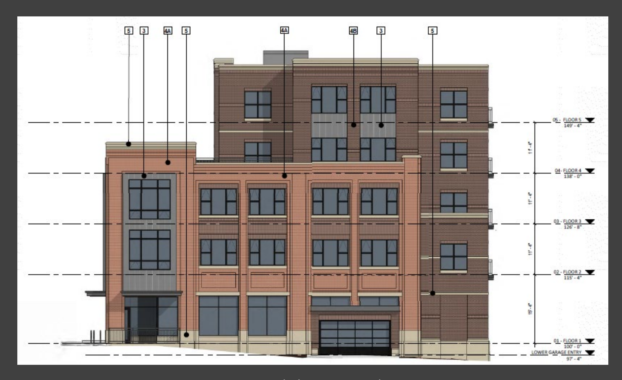
Proposed Blount Street Elevation