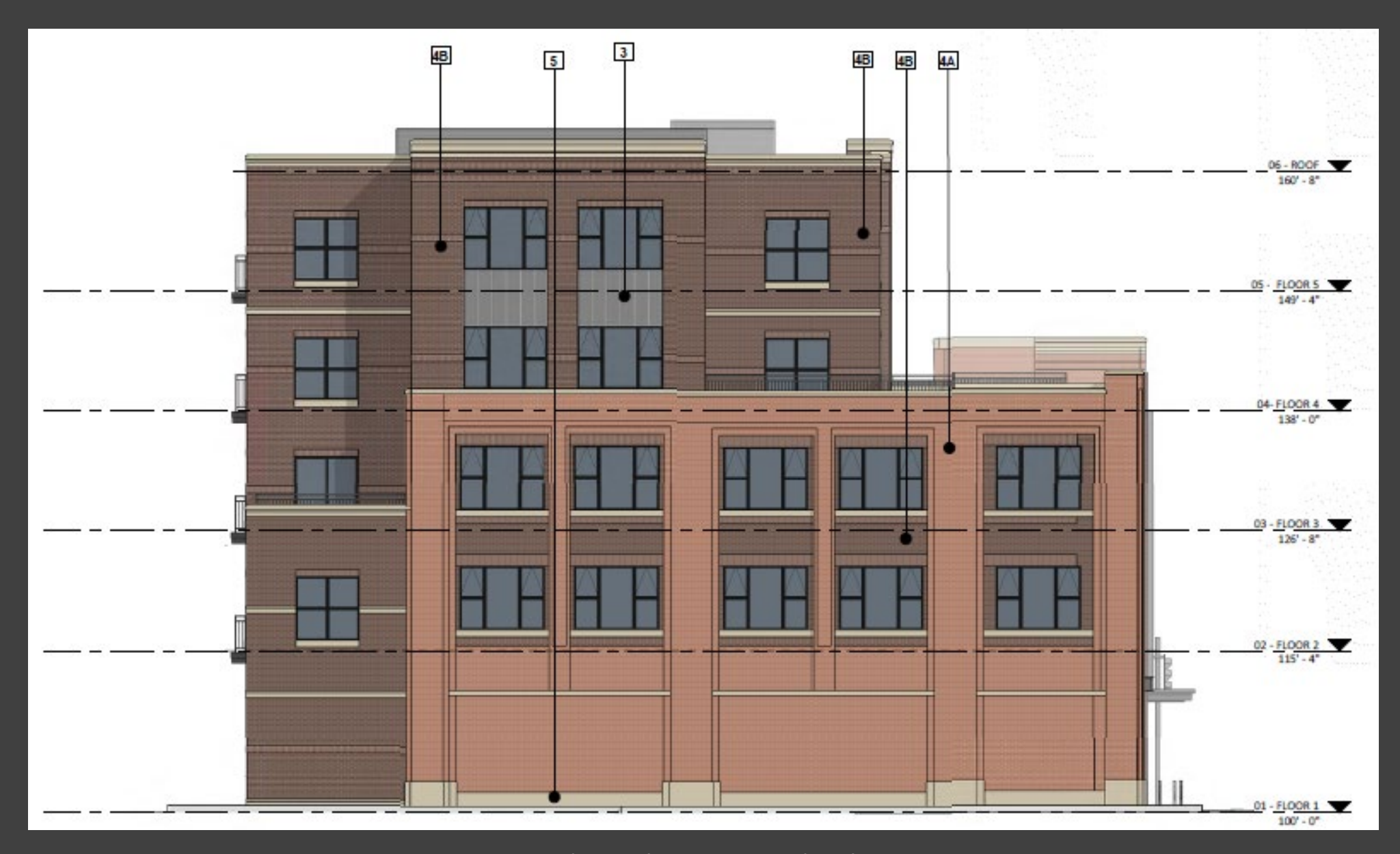
Proposed Southwest Façade Elevation