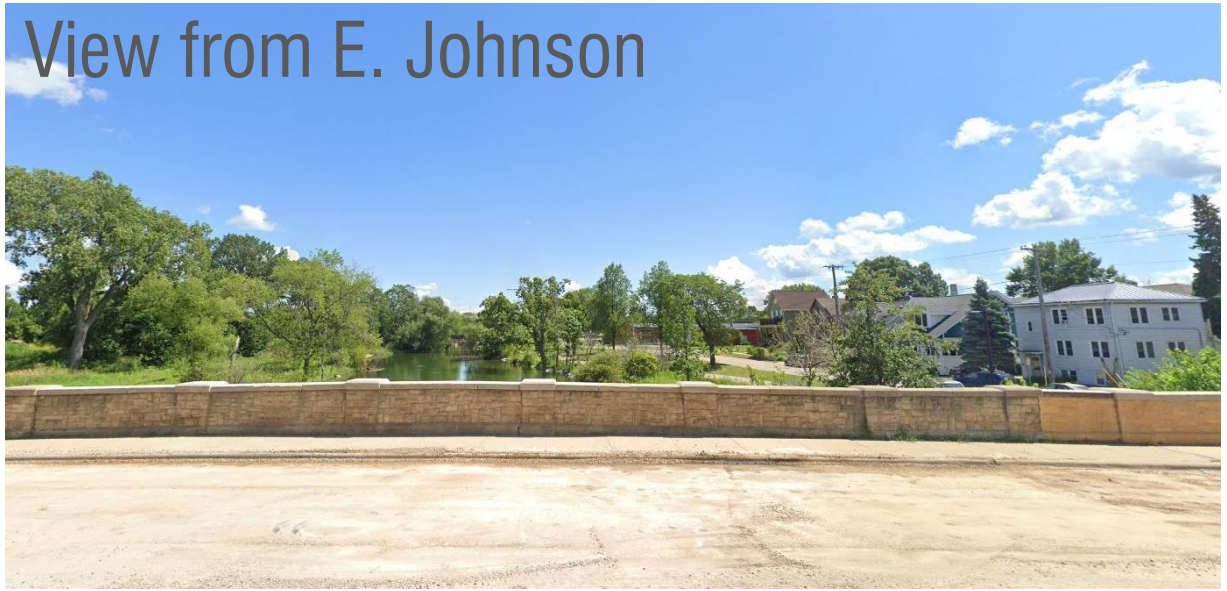
Other Existing Views Along the Yahara River