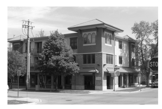
Figure D1: Entrance Orientation

Design Standards. The following design standards are applicable after the effective date of this code to all new buildings and major expansions (fifty percent (50%) or more of building floor area). Design standards shall apply only to the portion of the building or site that is undergoing alteration.