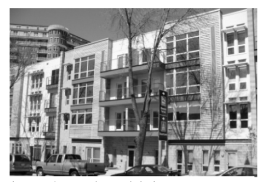
Figure D3: Facade Modulation