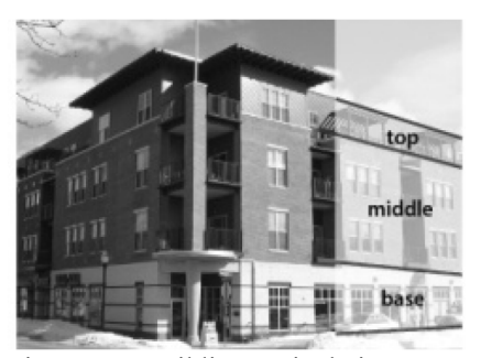
Figure D7: Building Articulation

(k) Ground-Floor Residential Uses. (See Figure D8.) Ground-floor residential uses fronting a public street or walkway, where present, shall be separated from the street by landscaping, steps, porches, grade changes, and low ornamental fences or walls in order to create a private yard area between the sidewalk and the front door.