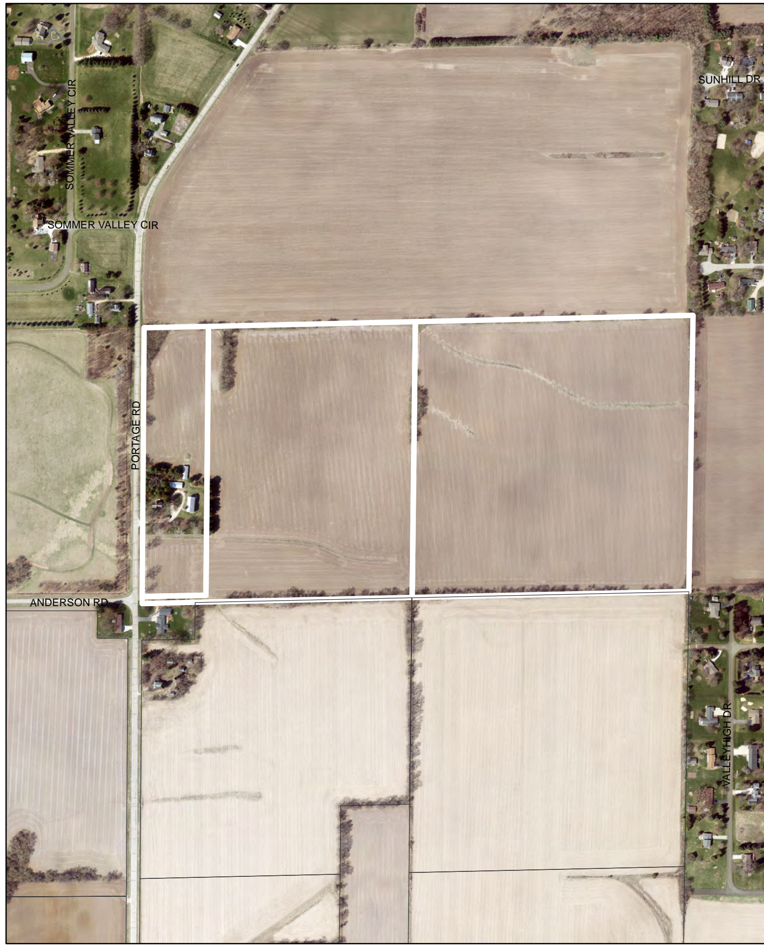
Date of Aerial Photography : Spring 2020