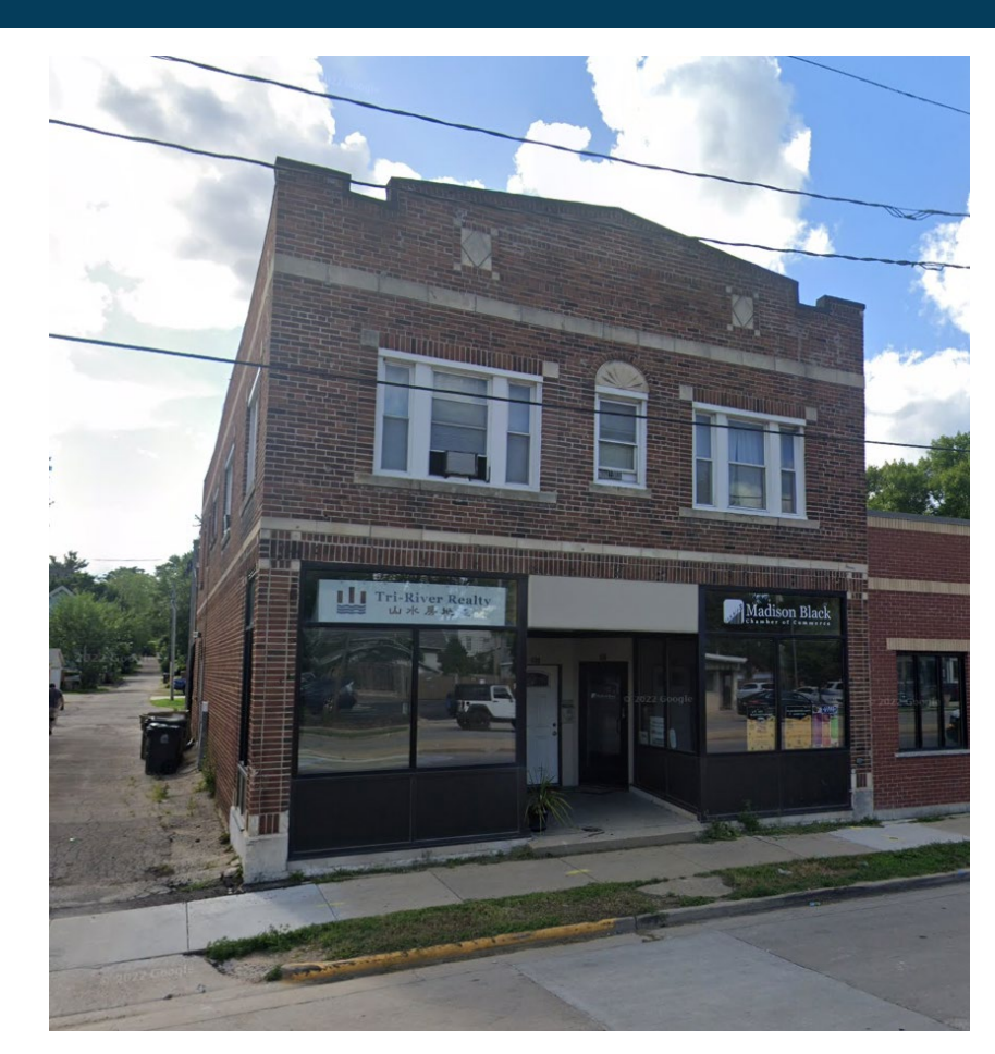
622 S. Park St.