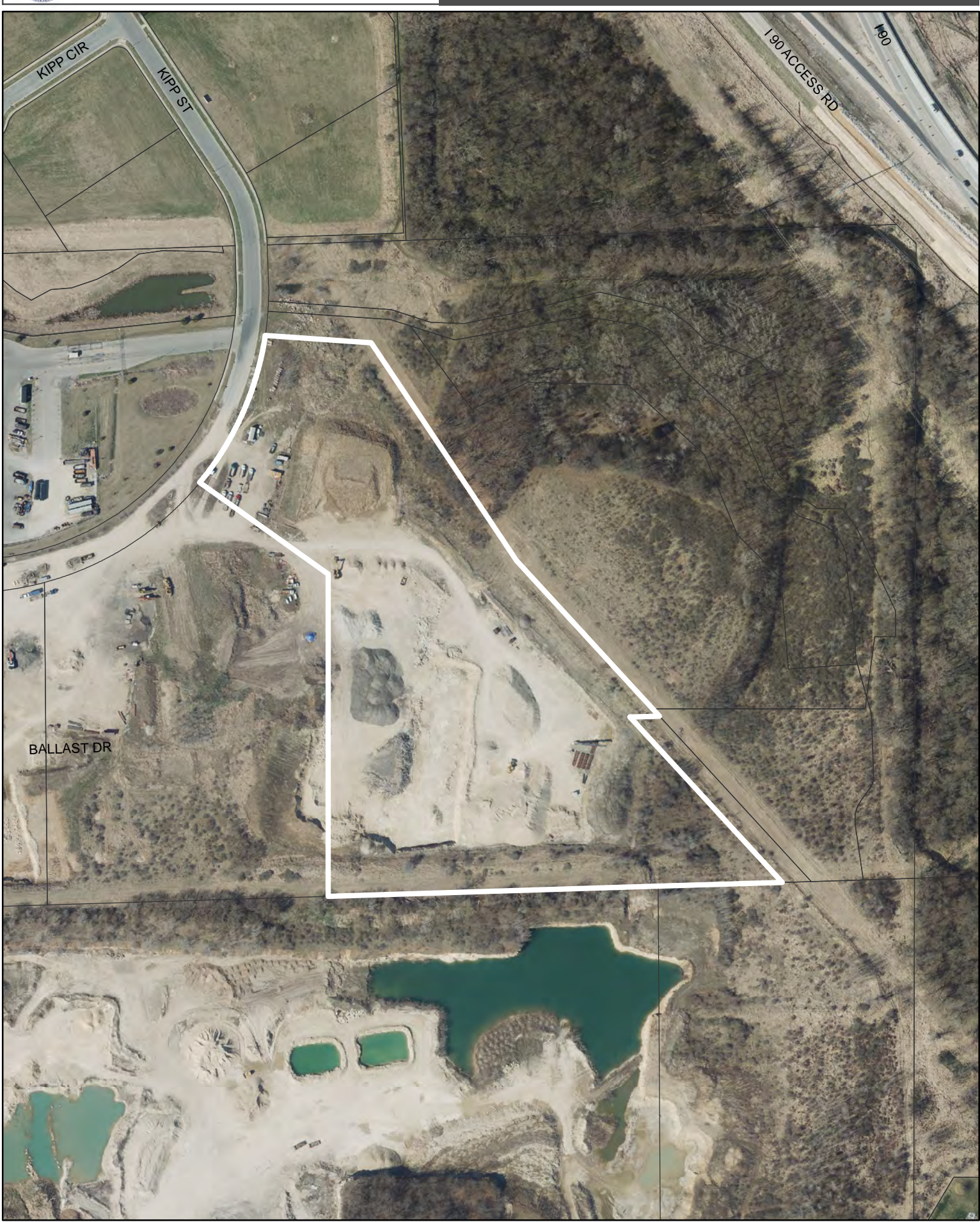
Date of Aerial Photography : Spring 2020