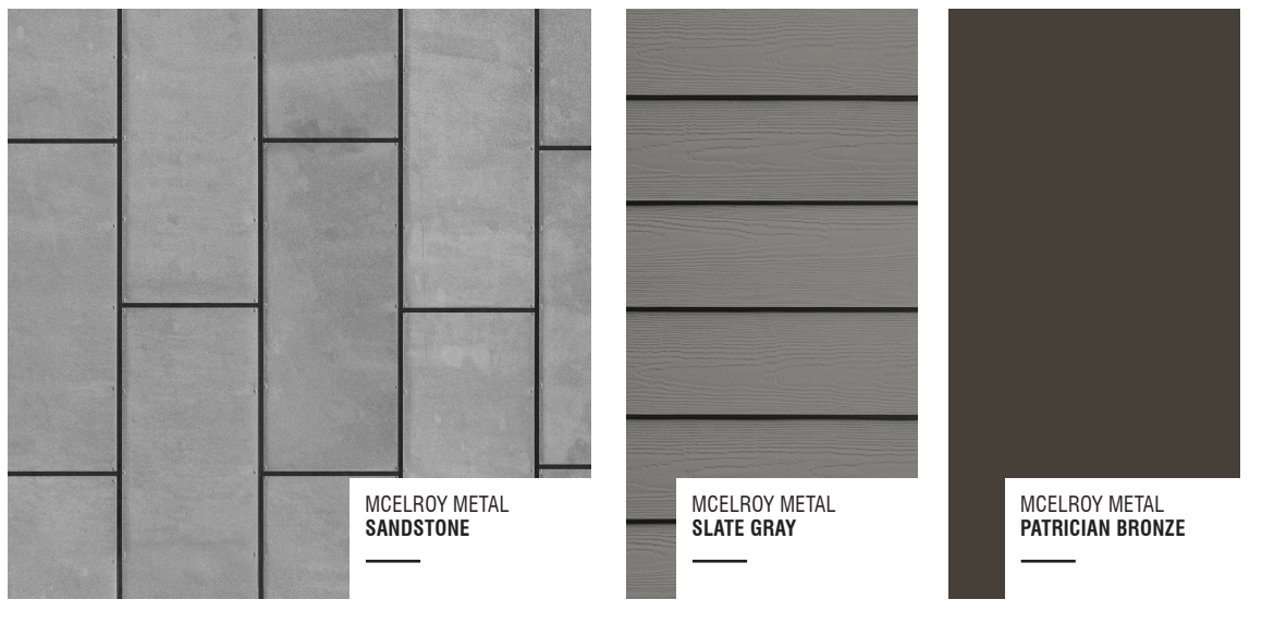
#1 - VISION LINE F-SERIES METAL PANEL