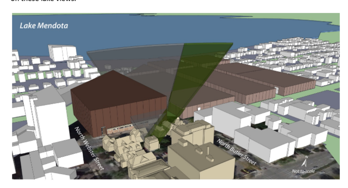
Image 4 – Aerial view of proposed building within same view as Image 3 above (No impact to view to Lake Mendota)

The diagram below shows the impact on views of Lake Mendota if redevelopment occurs at the maximum building heights currently allowed by zoning. The diagram below shows the viewshed corridor in comparison to the zoning code maximum height requirements. The Capitol North parking garage is shown at eight stories (88 feet) and significantly reduces the lake views from the house, while the James Madison Park Neighborhood, shown at four stories (44 feet), has little or no effect on these lake views.