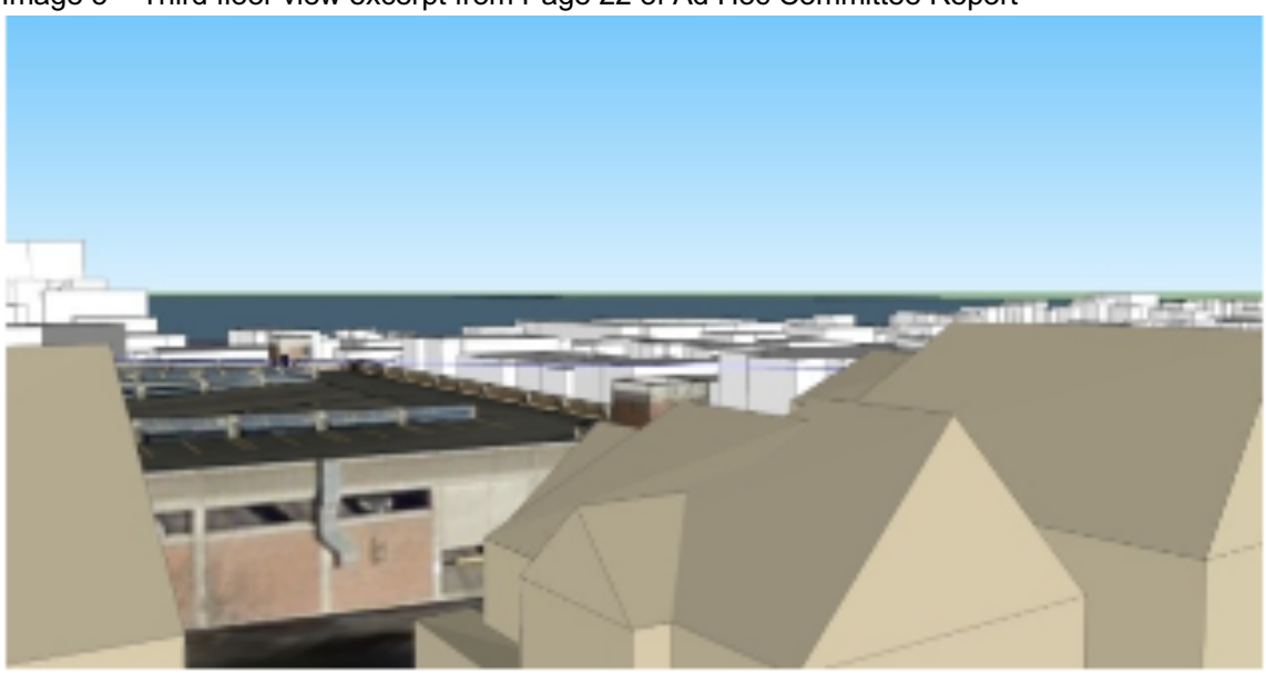
Image 6 – Third floor view of proposed building within same view as Image 5 above (Highest point of proposed building does not affect view to Lake Mendota beyond what is the current fabric of the surrounding neighborhood structures. If additional 4 story structures were placed between the proposed development and Lake Mendota, those structures would have greater impact on the view to the lake than this proposal.)