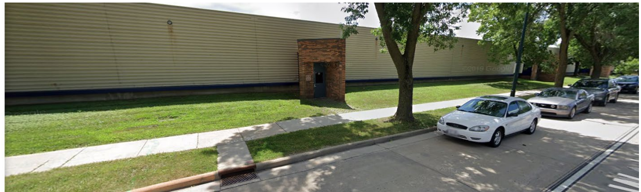
Google street view image of north building wall along East Washington.