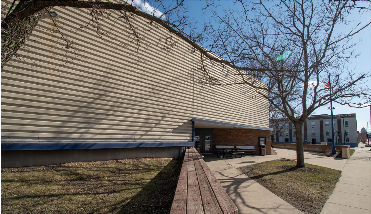
Image showing staff entrance near corner of Ingersoll and East Washington.