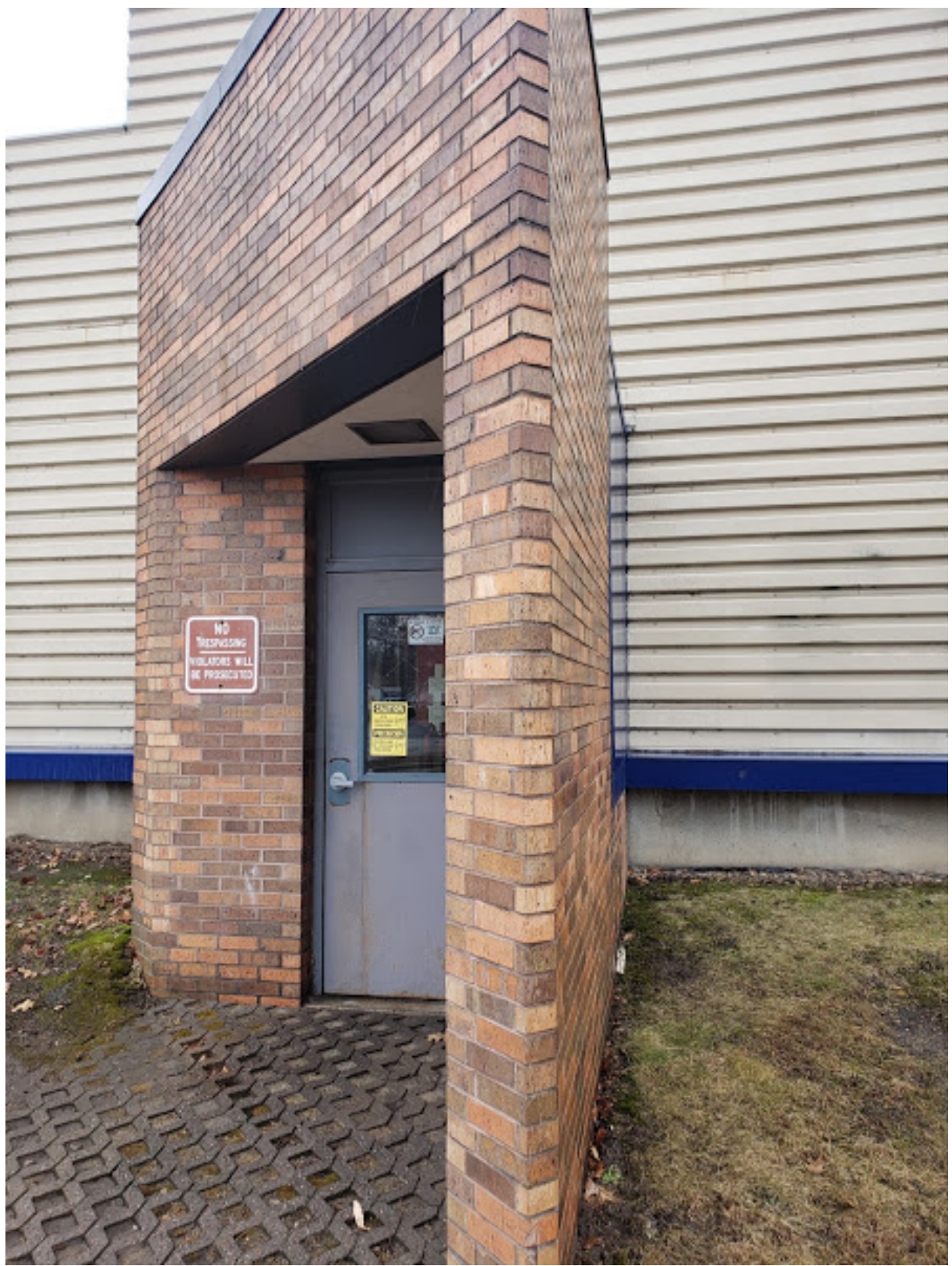
Egress portals project from the north providing the only indication of human scale. The portals have an angled expression and are clad in brick and blue metal panel which contrasts the horizontal siding used for the main body of the building.