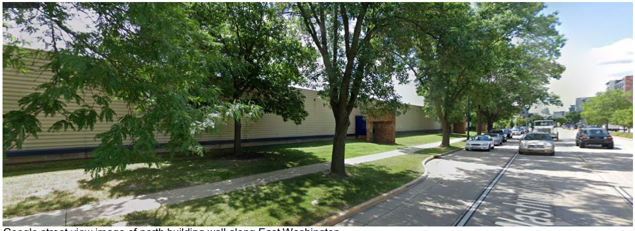
Google street view image of north building wall along East Washington.