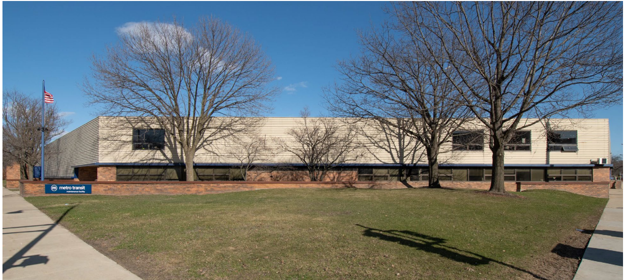
Image of the Metro Facility showing triangular green space at corner of Ingersoll and East Washington. Note low brick wall that creates inner paved area shown in image below.