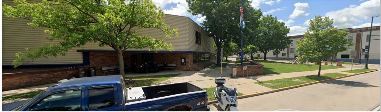
Google street view image of Metro Facility showing staff entrance and triangular green space at corner of Ingersoll and East Washington.