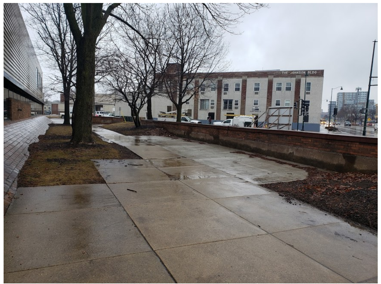
Metro Facility near corner of Ingersoll and East Washington showing the area inside the brick wall at the triangular green space.