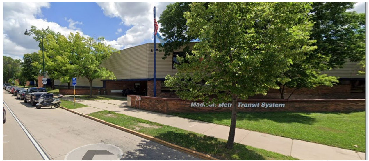
Google street view image of Metro Facility showing staff entrance and triangular green space at corner of Ingersoll and East Washington.