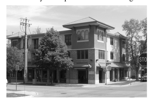
Figure D1: Entrance Orientation

(2) <u>Design Standards</u>. The following design standards are applicable after the effective date of this code to all new buildings and major expansions (fifty percent (50%) or more of building floor area). Design standards shall apply only to the portion of the building or site that is undergoing alteration.