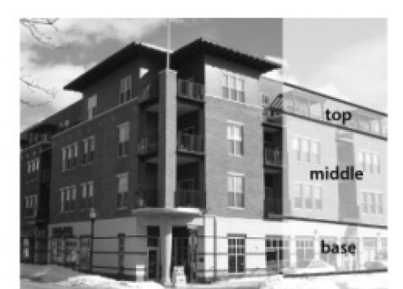
Figure D7: Building Articulation

(k) Ground-Floor Residential Uses. (See Figure D8.) Ground-floor residential uses fronting a public street or walkway, where present, shall be separated from the street by landscaping, steps, porches, grade changes, and low ornamental fences or walls in order to create a private yard area between the sidewalk and the front door.