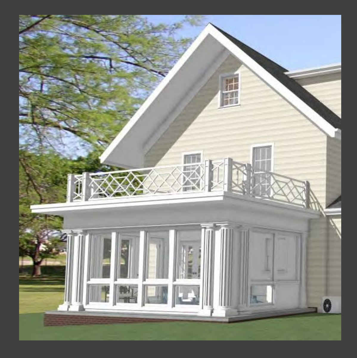
Proposed Four Season Room