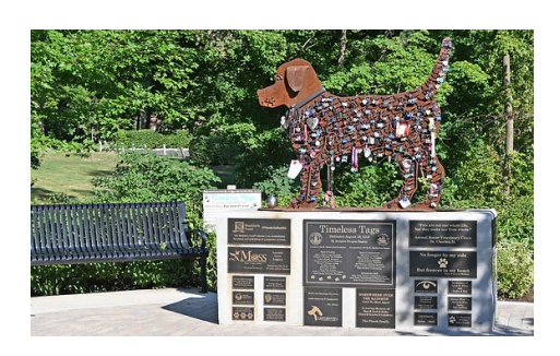
St. Charles, IL