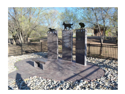
El Paso County, CO