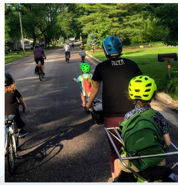
Photo of families biking to school for Bike & Roll to School Day including parents and kids on their own bikes and a cargo bike with a child on back