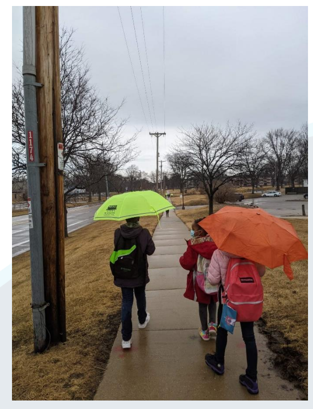
Photo of a walking school bus on a rainy day with people carrying brightly colored umbrellas