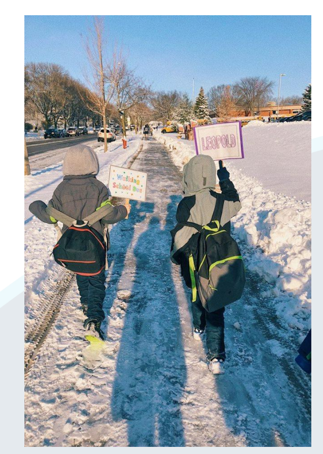
Photo of 2 children on the Leopold Walking School Bus holding signs and walking in the winter.