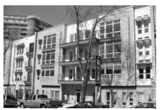
Figure D3: Facade Modulation