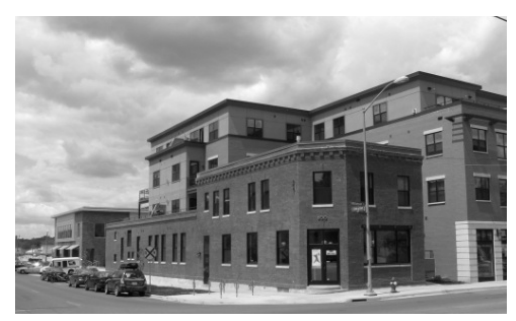
Figure D4: Variation in Roof Lines

No blank walls shall be permitted to face the public street, sidewalks, or other public spaces such as plazas. Elements such as windows, doors, columns, changes in material, and similar details shall be used to add visual interest.