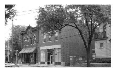
Figure D5: Compatibility with Traditional Buildings

(h) <u>Compatibility with Traditional Buildings</u>. (See Figure D5.) New development shall relate to the design of traditional buildings adjacent to the site, where present, in scale and character. This can be achieved by maintaining similar, facade divisions, roof lines, rhythm and proportions of openings, building materials and colors. Historic architectural styles need not be replicated.