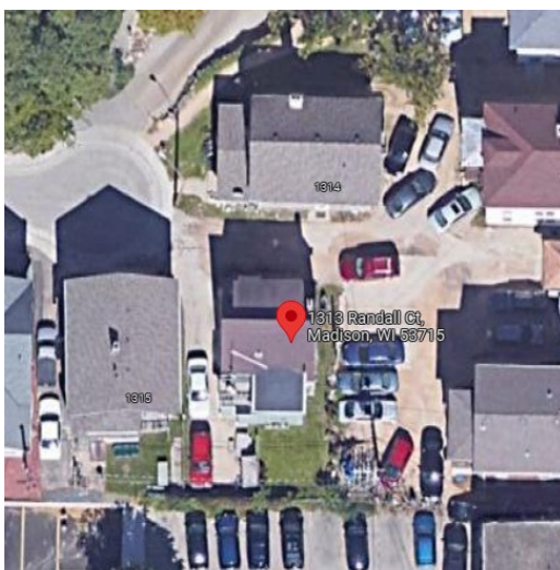
Zillow, no Google Street View available