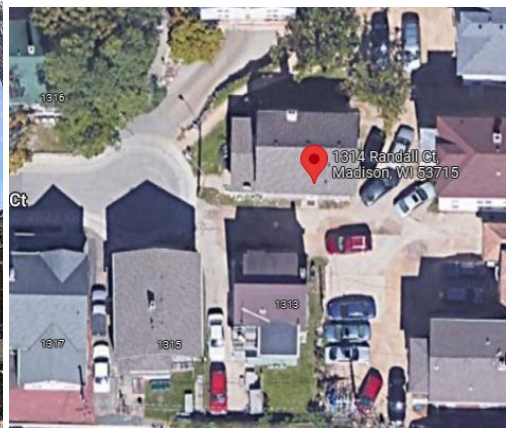
Zillow, no Google Street View available