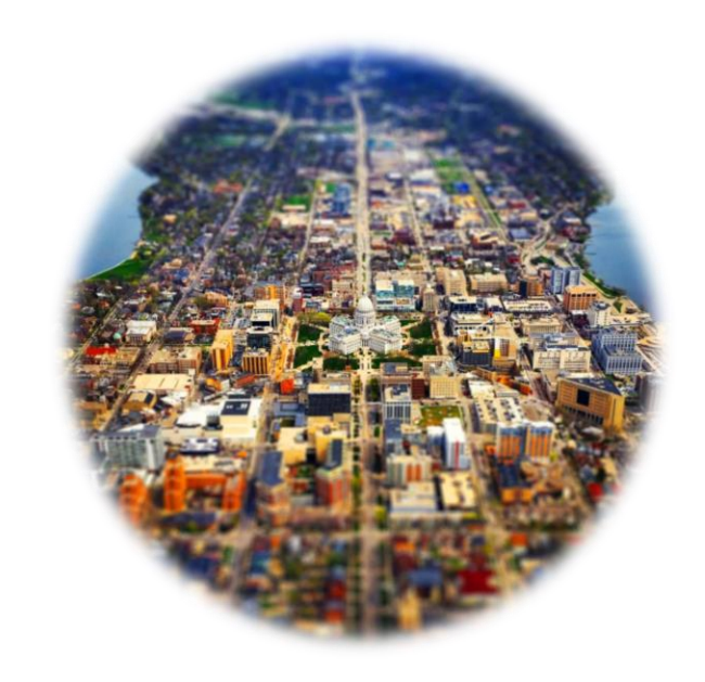
Madison's Vision: Our Madison: Inclusive, Innovative & Thriving

Elements are the priority topic areas identified by feedback from: