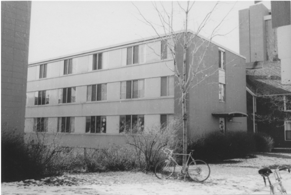
WHS Architecture and History Inventory #160490