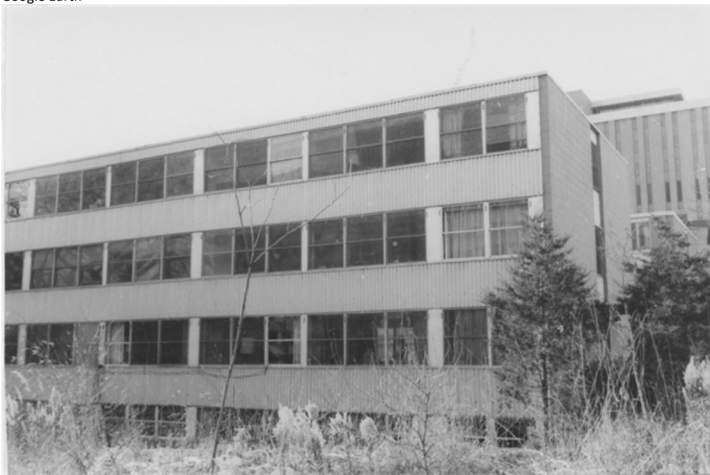
WHS Architecture and History Inventory #160471

Staff Findings: A preservation file for this property does not exist. The Wisconsin Historical Society property file identifies Zoe Bayliss Hall as a university or college building, designed by Madison architects Weiler & Strang.