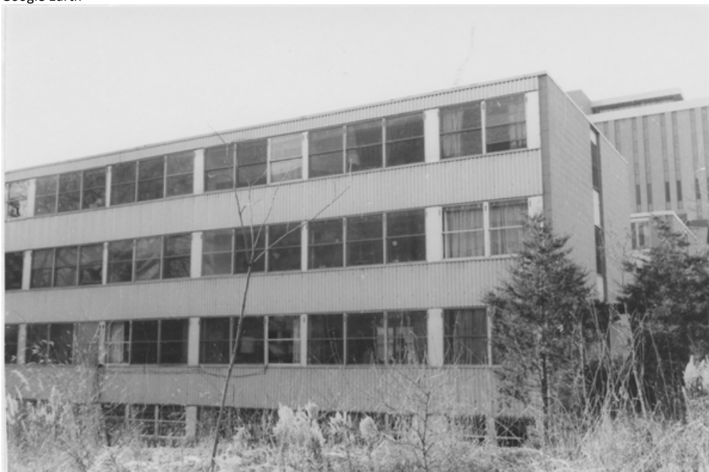
WHS Architecture and History Inventory #160471

Staff Findings: A preservation file for this property does not exist. The Wisconsin Historical Society property file identifies Zoe Bayliss Hall as a university or college building, designed by Madison architects Weiler & Strang.