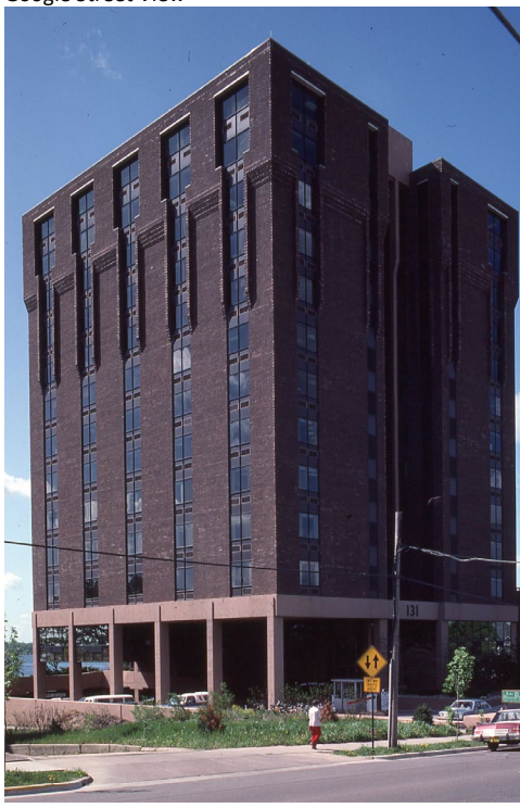
City of Madison Historic Preservation Slides