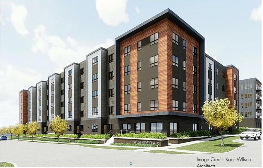
https://www.precipitatearch.com/west-side-flats (now called Verdant)

St. Paul, construction began in 2020, the building was pre-certified, and there are multiple articulations.