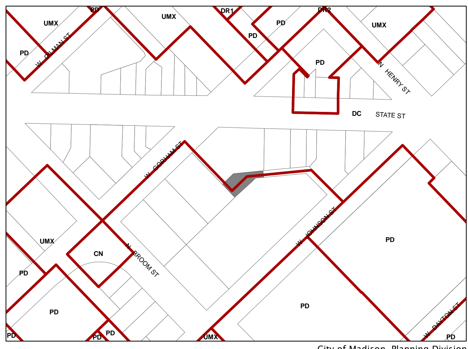
City of Madison, Planning Division