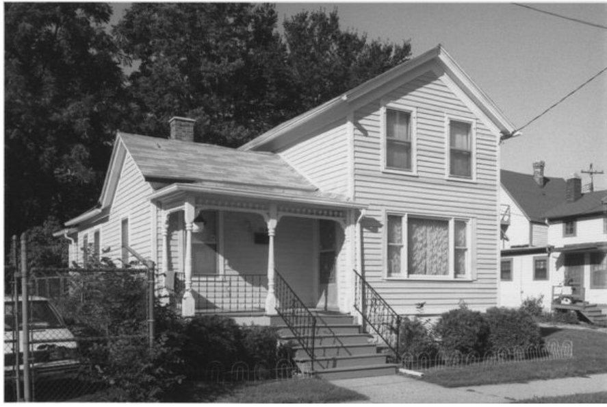
WHS Property Record #95157