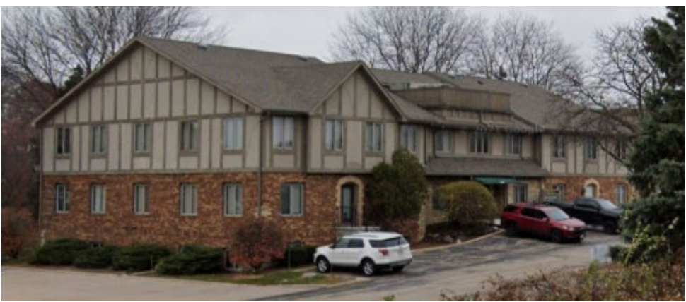
Glock Tower Office Park 6825 Odenna For Madison, Wij 52719

Commercial building constructed in 1979.