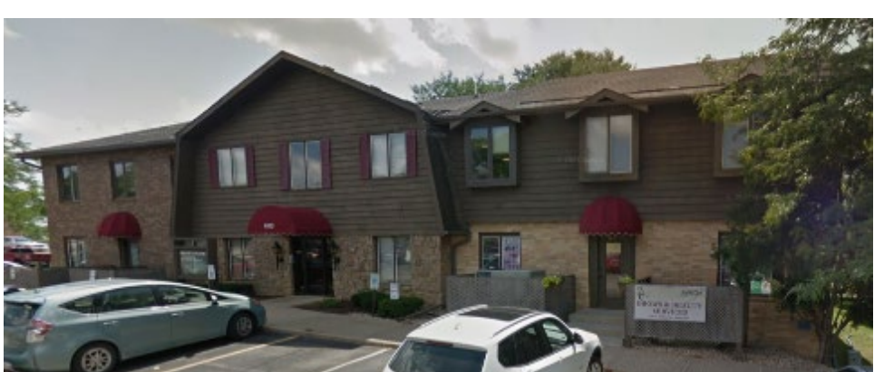
A Better Body Massage Therapy (Slock Tower Office Park SwanLeap)

Commercial building constructed in 1977.