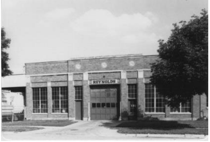
WHS Property Record #95550