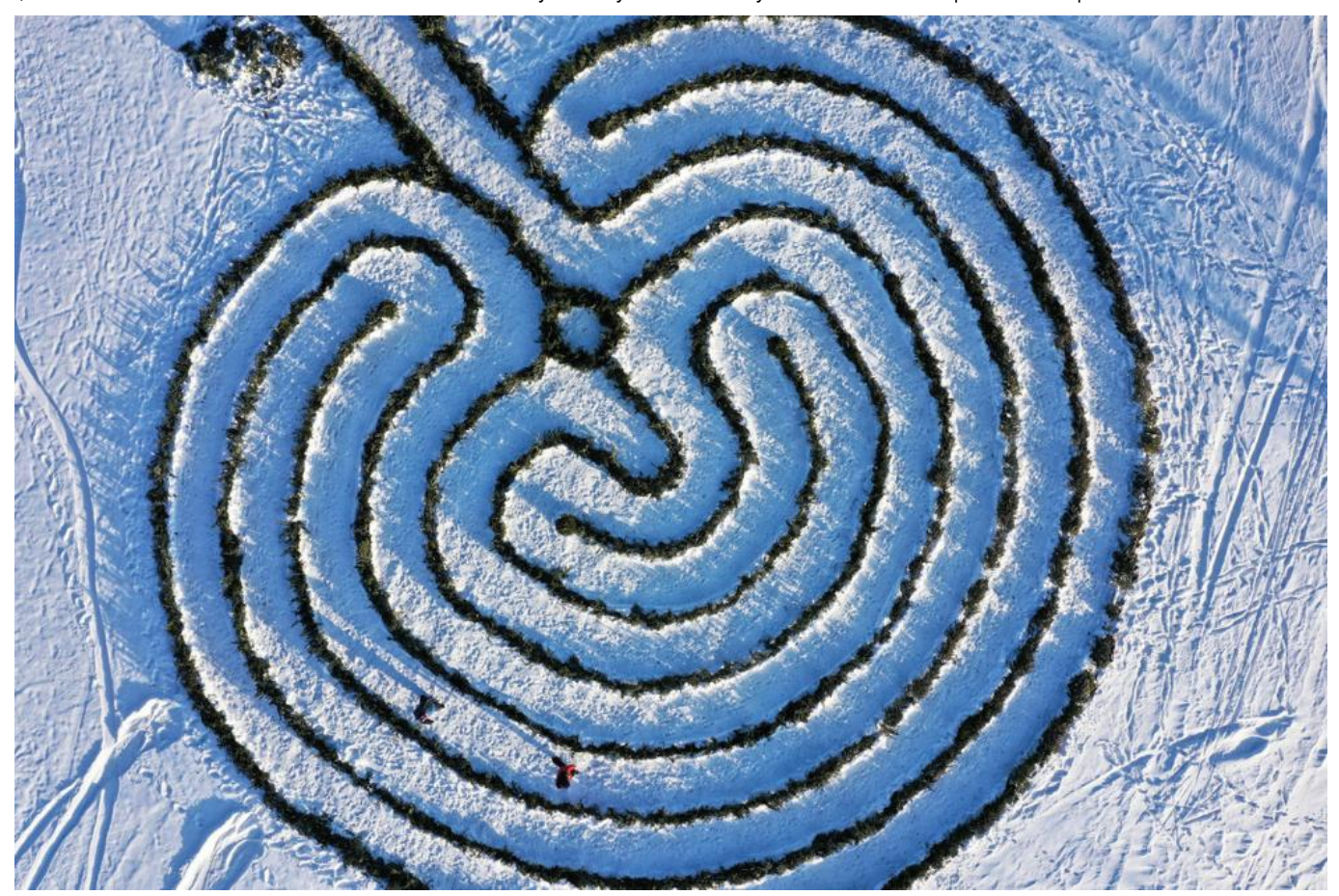
The paths of the temporary labyrinth at Olbrich Park bend back upon themselves, creating a path of quiet contemplation.