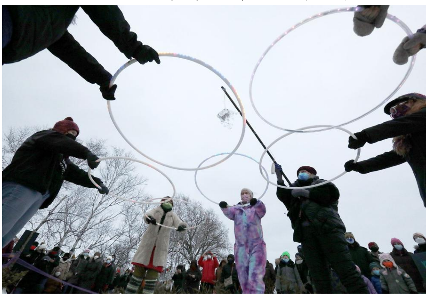
Hoop dancers dedicate the labyrinth at the public opening for "How Lovely Are Thy Branches" at Olbrich Park.