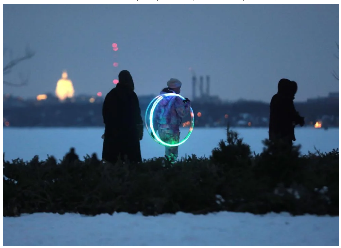
Visitors to the public opening Sunday for "How Lovely Are Thy Branches" walk through the public art installation at Olbrich Park after sunset.