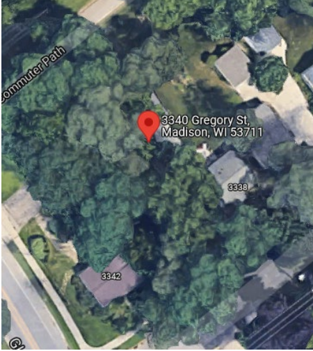
PC application materials