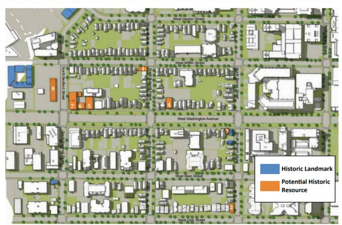
Excerpt from Mifflandia Plan, 2019