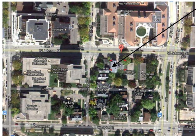
Google street view image and map