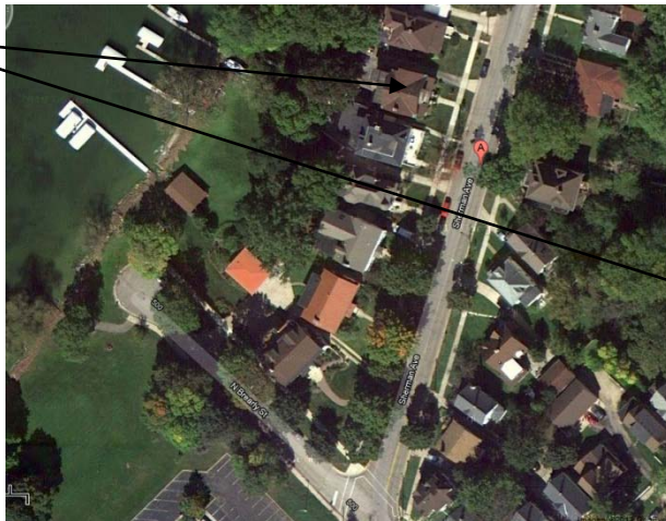
Google street view image and map