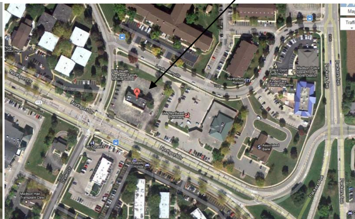
Google street view image and map