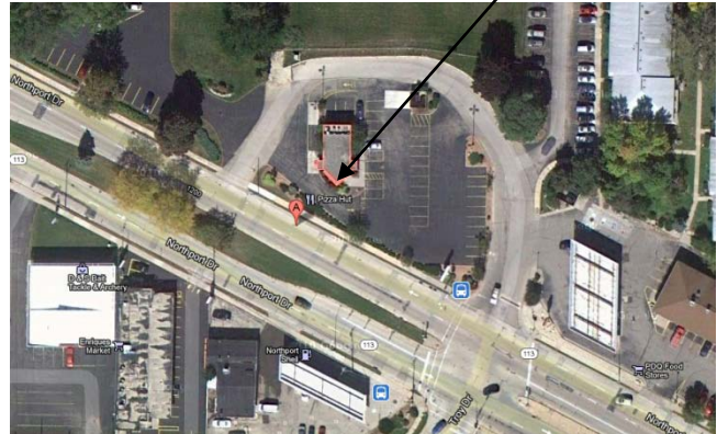
Google street view image and map

Applicant: Brad McClain, UW Credit Union