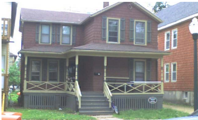
Assessor photo (approximately 15 years old)

Single family residence built in 1894 and currently zoned R6.