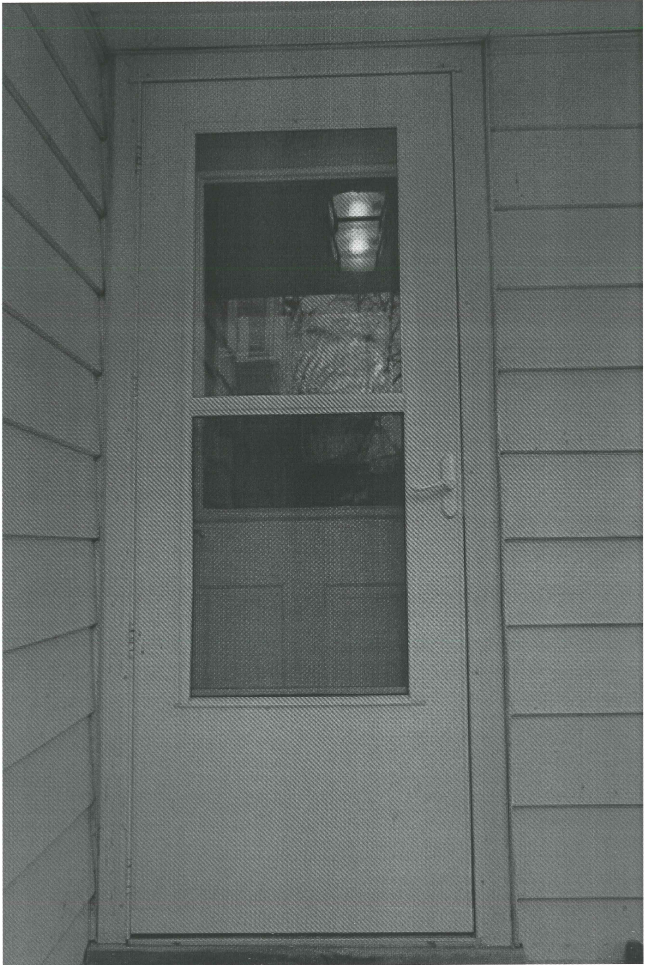
1708 REGENT - REUSE EXISTING DOOR