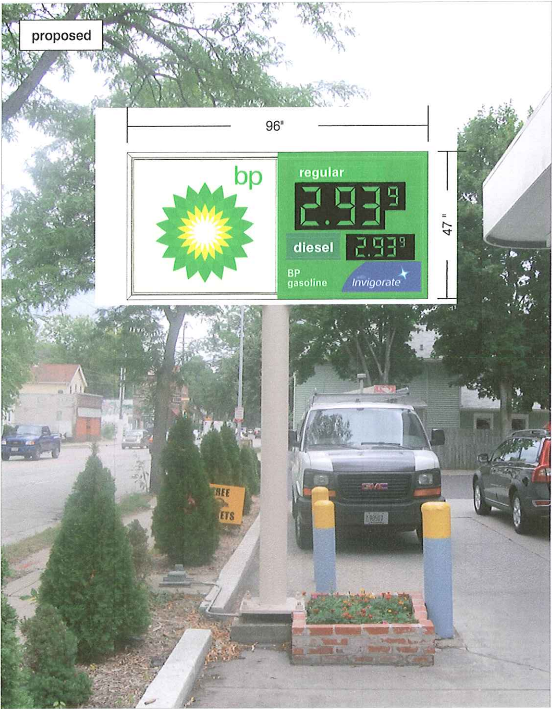
Total Height of Proposed: 12'