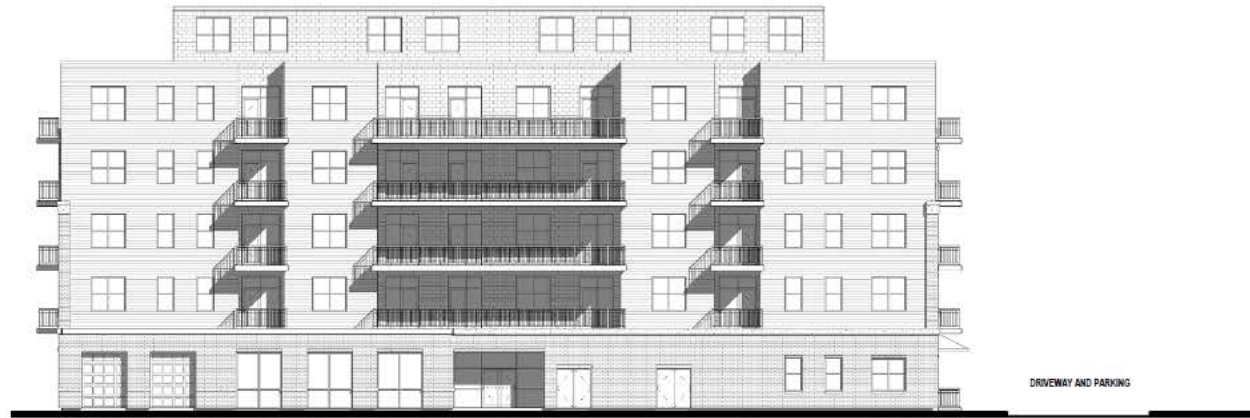
2 NORTH ELEVATION

©2019 Plunkett Raysich Architects, LLP. 15. July 2019. #1902242