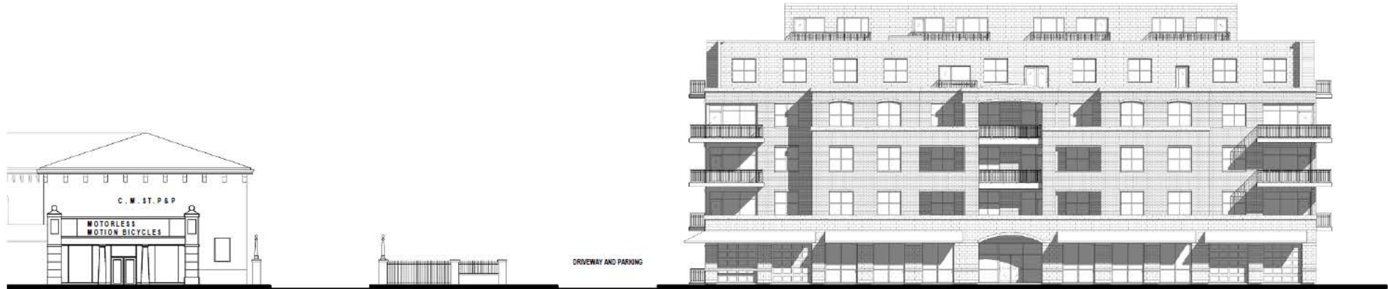
1 SOUTH ELEVATION