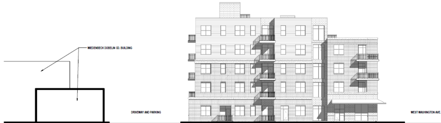
2 WEST ELEVATION