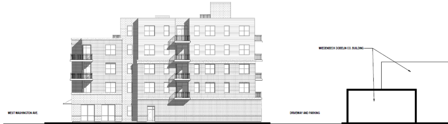
1 EAST ELEVATION