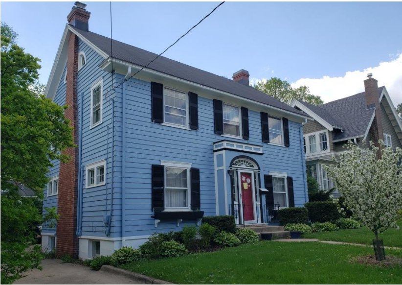
Drive and front view looking southwest