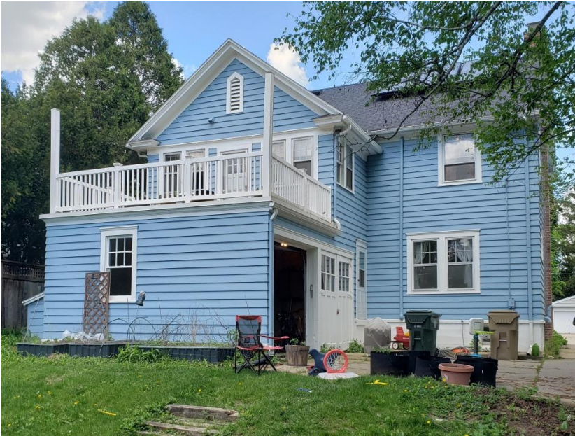
Rear view looking northwest