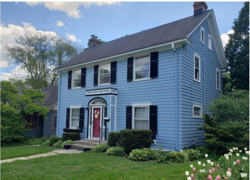
Front view looking southeast