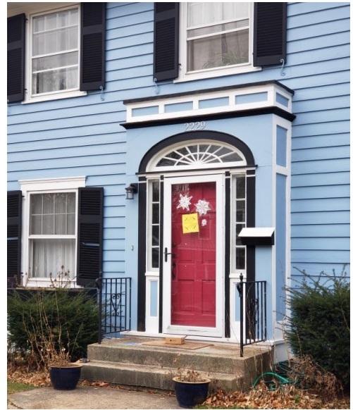
Front entrance looking southeast