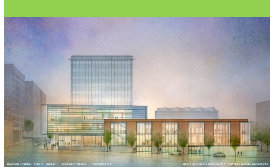
Madison Central Public Library Madison, Wisconsin

Prepared by: Facilities & Sustainability Department Staff , Dept. of Public Works, Engineering Division, City of Madison