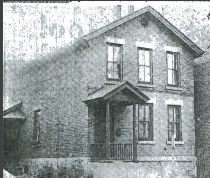
From “All Around the Town: 318 N Broom St. Old Behrand Home Keeps Simple Dignity” Alexis Baas in The Capital Times , Nov 10, 1950