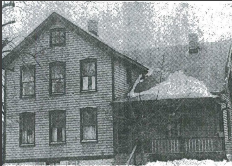
From “All Around the Town: 304 N Broom St. Old Cnare Home Built ‘to Last Forever’” Alexis Baas in The Capital Times , Sep 8, 1950