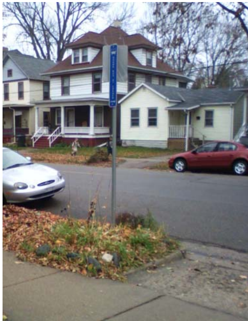
Example of “Board Bus at Corner” sign

Metro Transit currently serves just over 2,000 unique bus stop locations. About 1,000 of these signs are expected to lack any information on the rear side of the signage at present. The Committee proposes a pilot project to mark both sides of bus stop signs. The pilot project would consist of applying an adhesive sticker, produced by the City of Madison sign shop, to the rear sides of bus stop signs. Metro should pick a trial route to test, install these stickers and collect passenger feedback. If the presence of stickers makes it easier to identify stops and thus to ride the bus, they should be placed on all remaining signs.