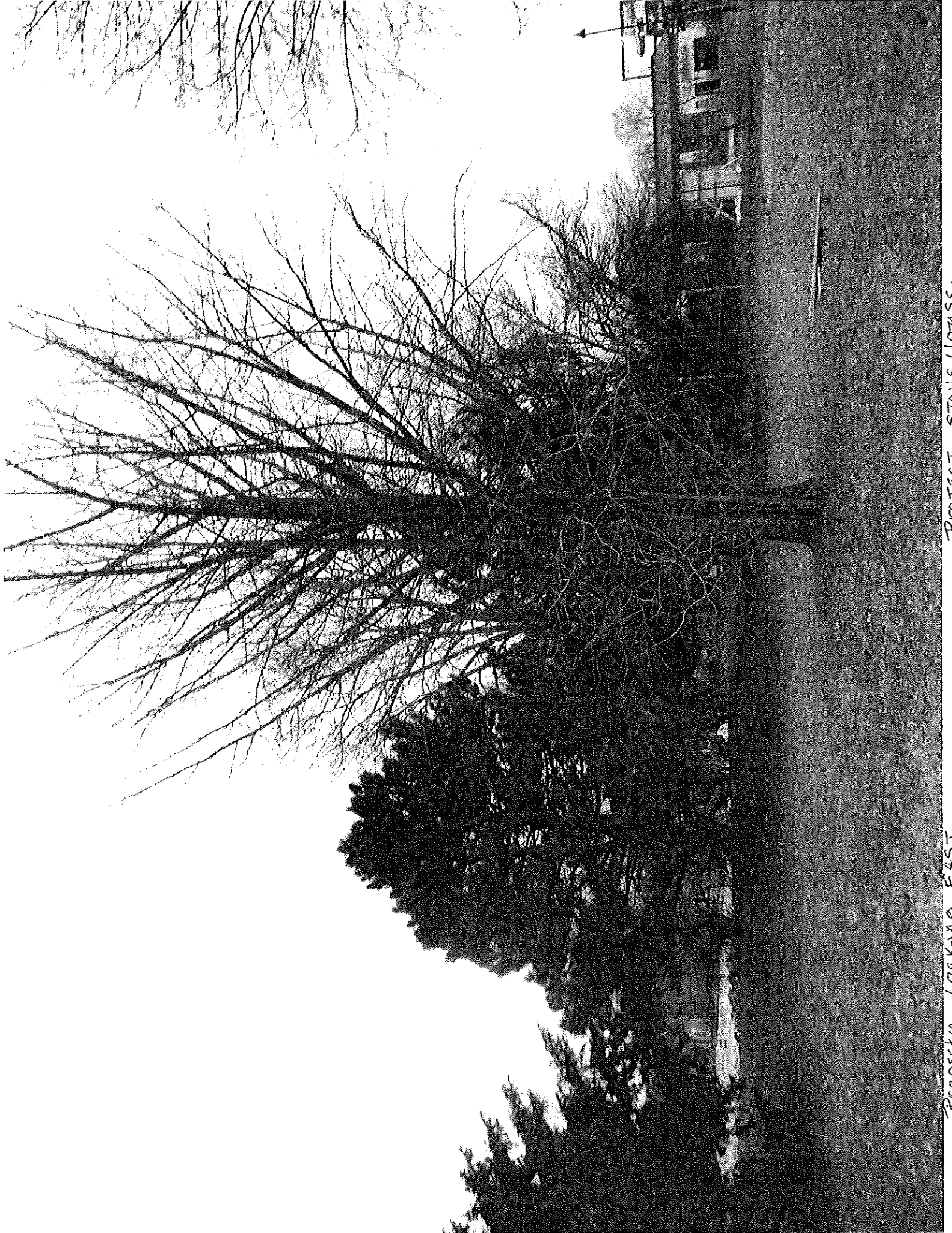
PROJECT STONE HOUSE