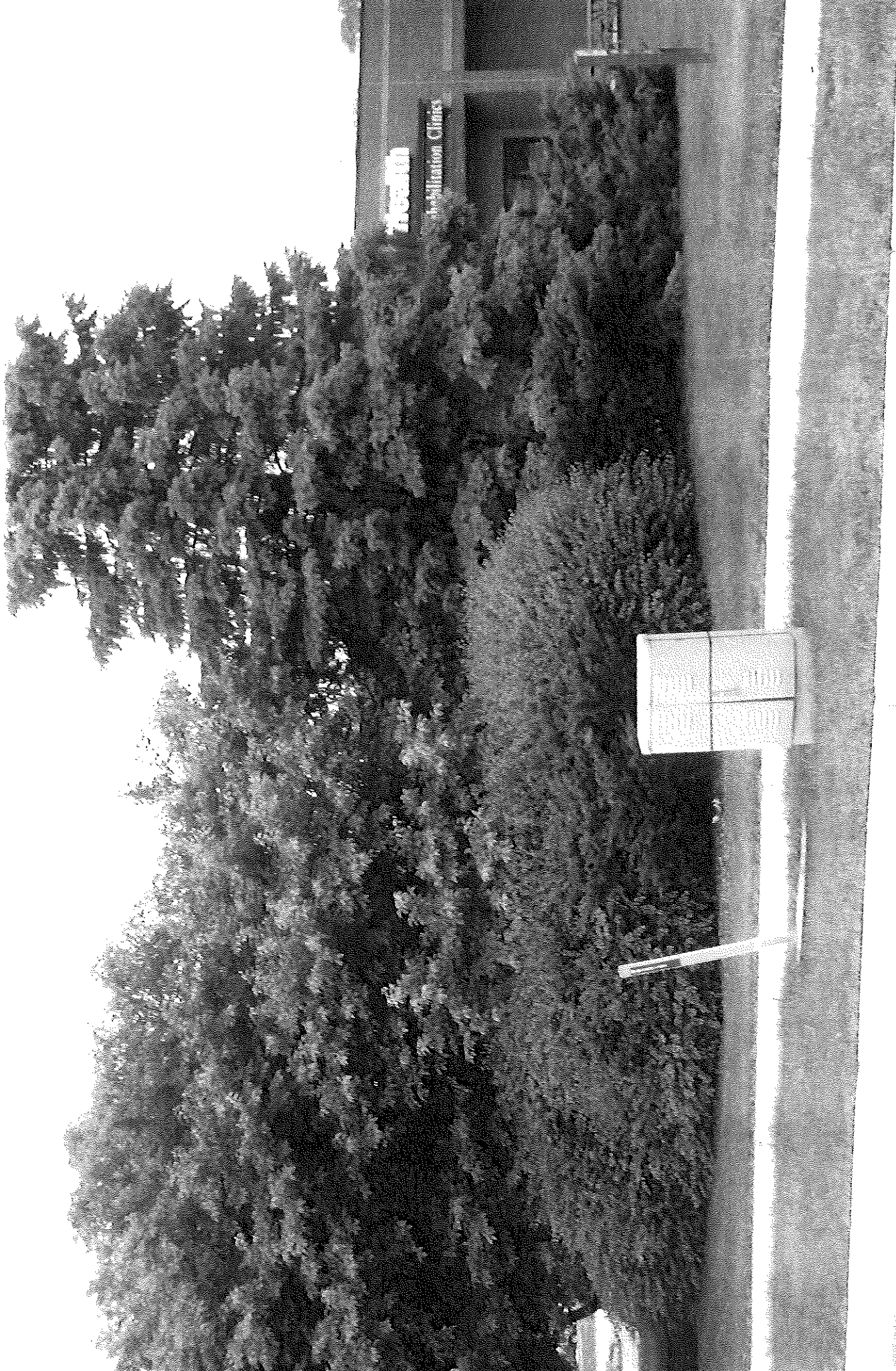
#1 WEST SIDE EXAMPLE : TREE ALLOWANCE UNIVERSITY AVE.