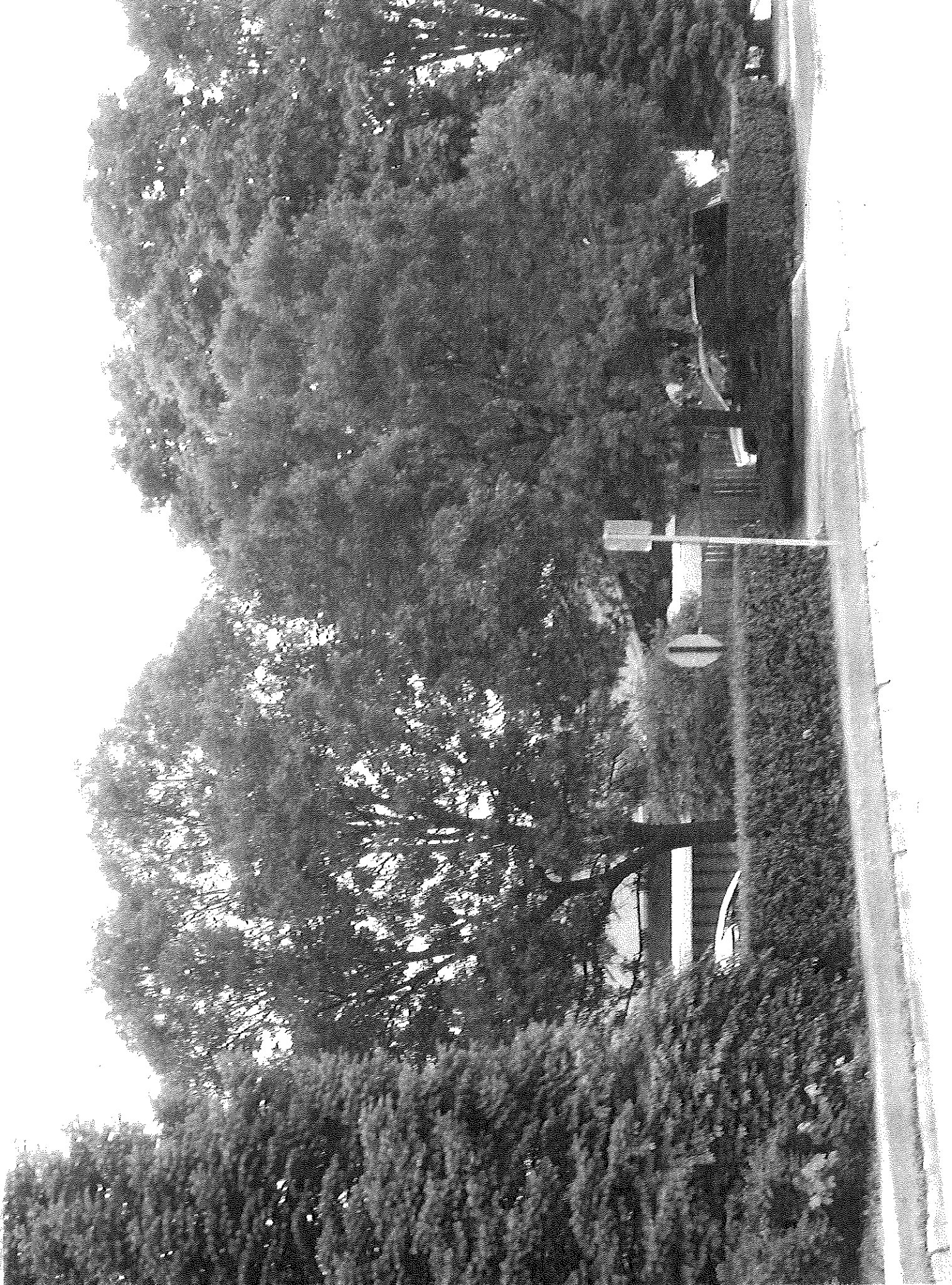
# 2 WESTSIDE EXAMPLES : Mineral Point Rd.