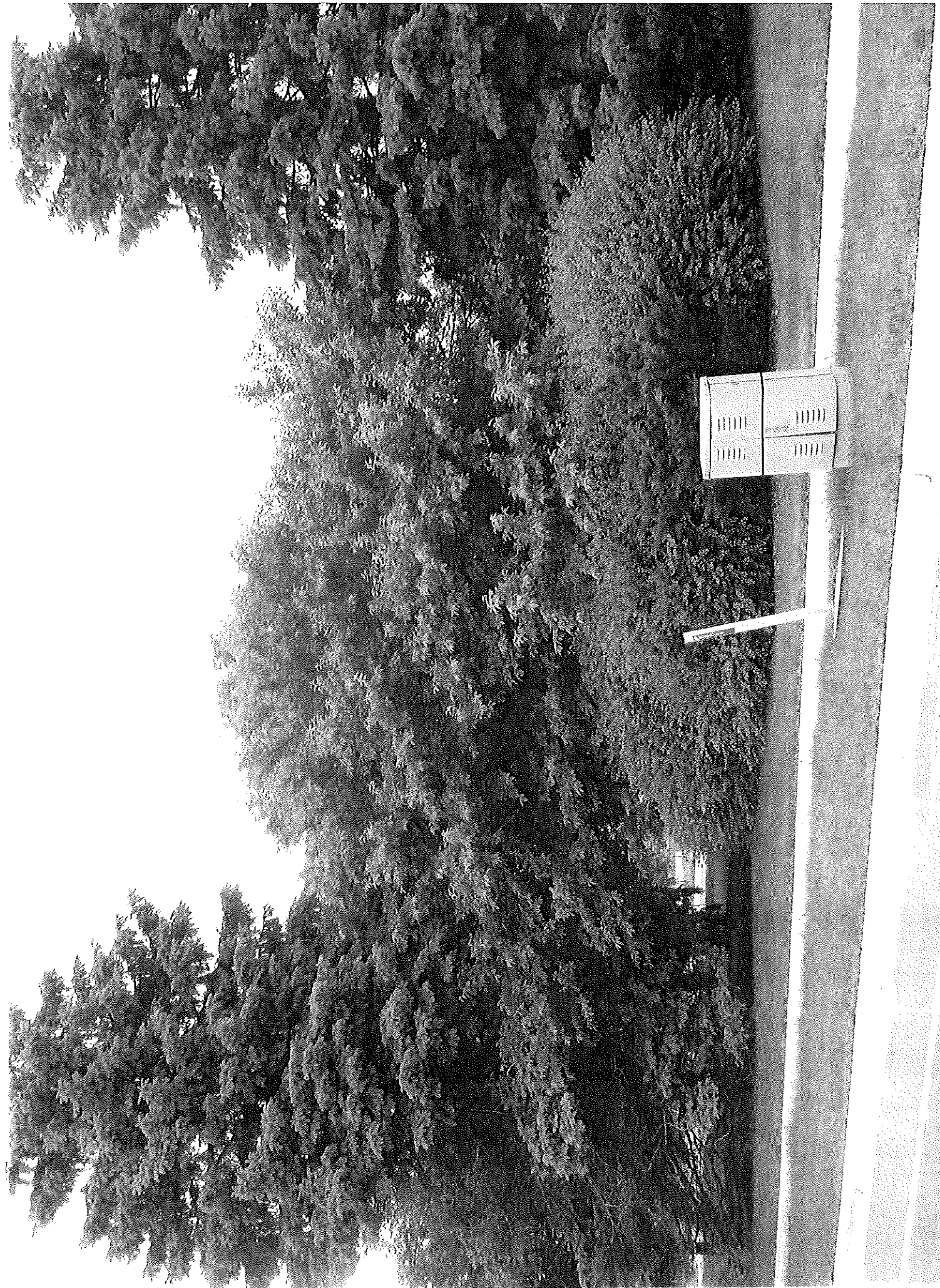
#1 WEST SIDE EXAMPLE: MIDDLETON UNIVERSITY AVE