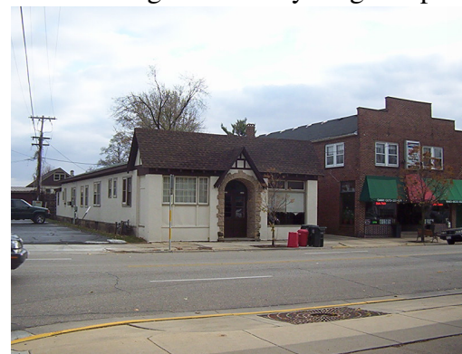
View of Papa Phil's Restaurant and a residential bldg. along Monroe St.