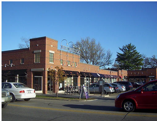
View of Knickerbocker Place along Monroe Street