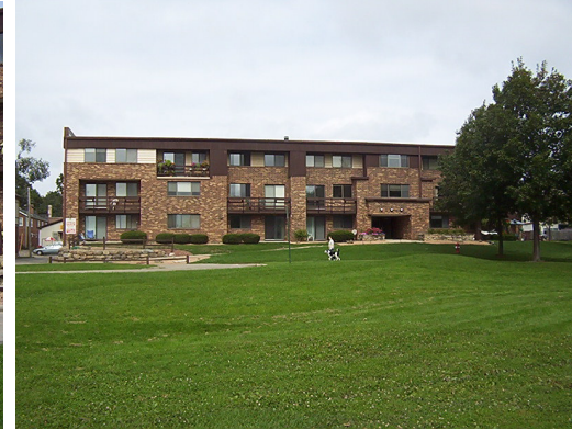
Views from park looking towards Arbor Drive.