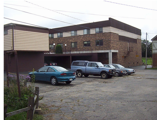
View from back of Knickerbocker Place looking Towards existing multifamily bldg and park.