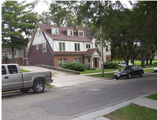
View from Knickerbocker St. to corner of Arbor Dr.