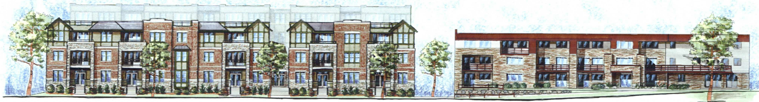
ARBOR DRIVE STREETSCAPE