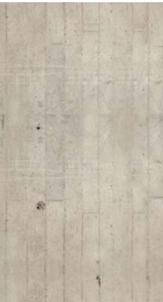
BOARD FORMED CONCRETE