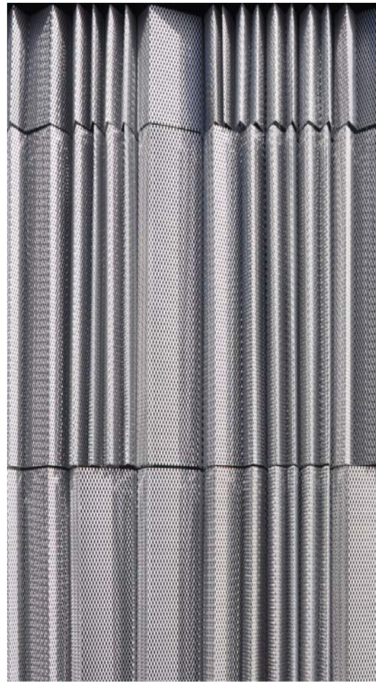
PERFORMATED CORRUGATED METAL