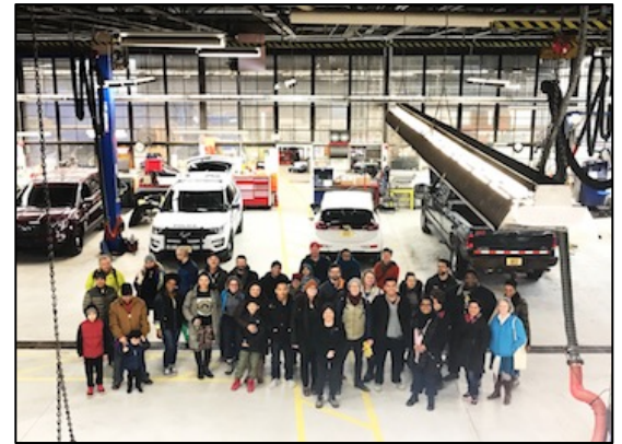
MarketReady participants and staff touring the Fleet Services Building, the future home of the Madison Public Market

MarketReady is a small business development program connected with the Madison Public Market, funded by the City of Madison, and administered by the Northside Planning Council. It supports 30 entrepreneurs as they start or expand their business. Participants come from groups facing structural barriers to business ownership.