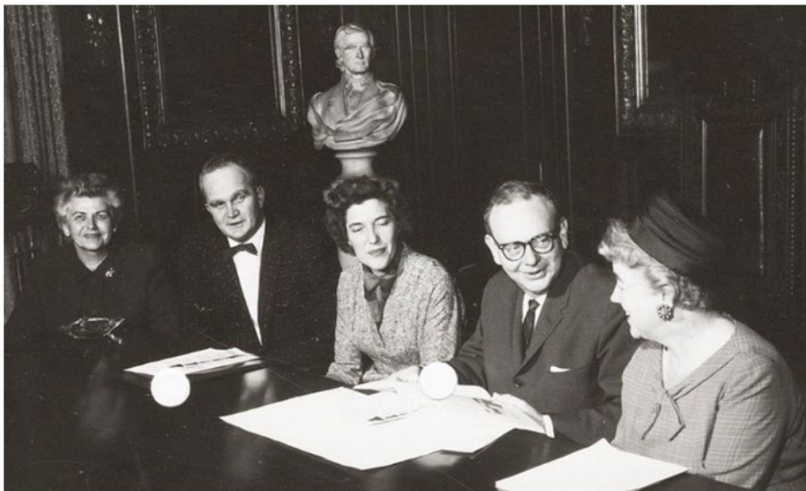
Governor's Commission on the Status of Women. May 8, 1968.