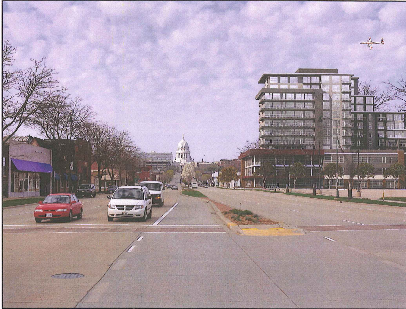
VIEW TOWARDS CAPITOL