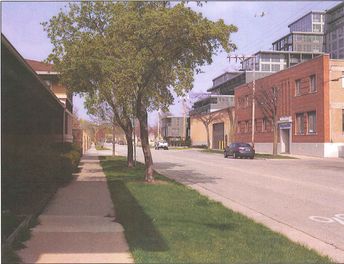
VIEW ON MIFFLIN