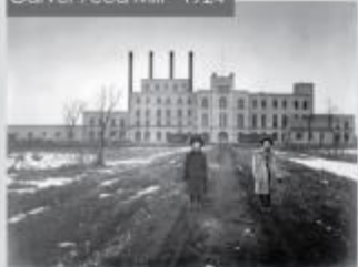
Garver Feed Mill - 1924